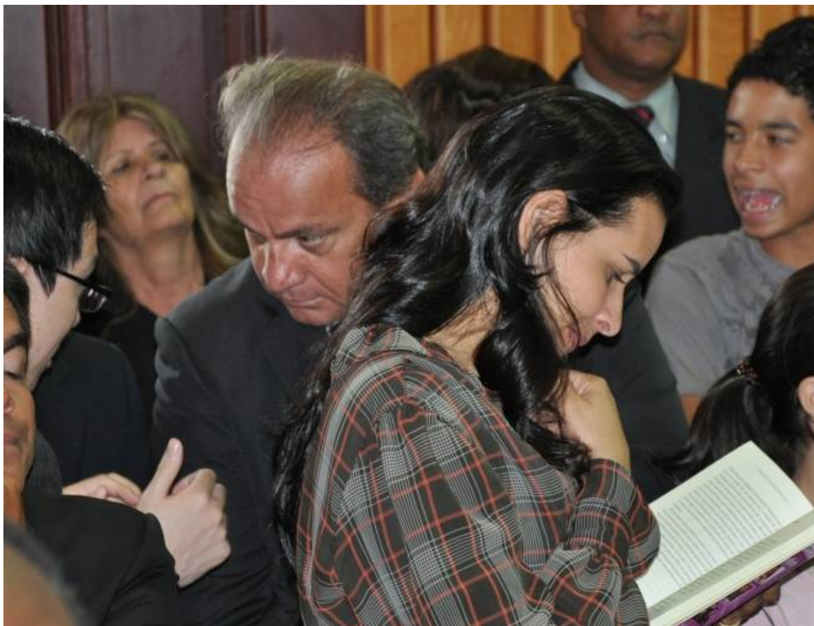
Staff telling the members not to break through security lines