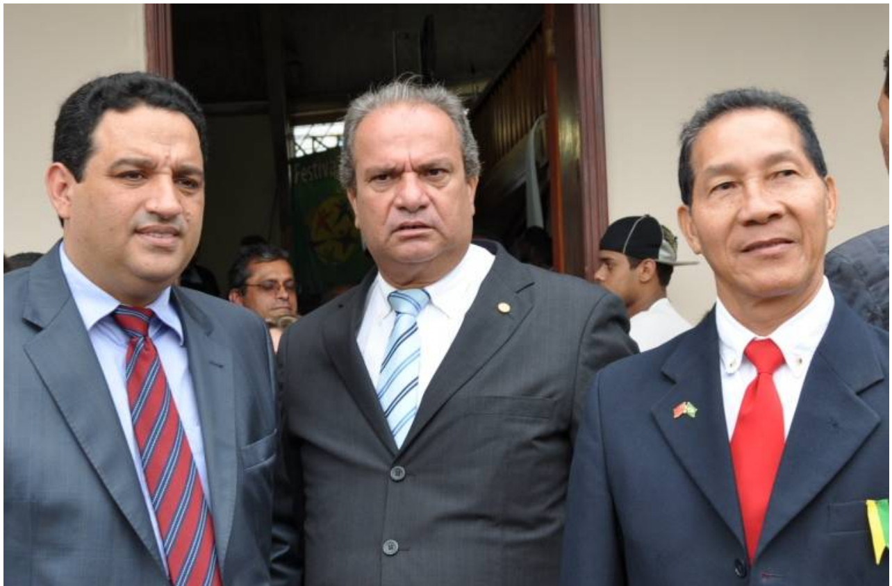
3 members at the event in the Bishop's church – they were trying to break through security lines to reach the Bishop