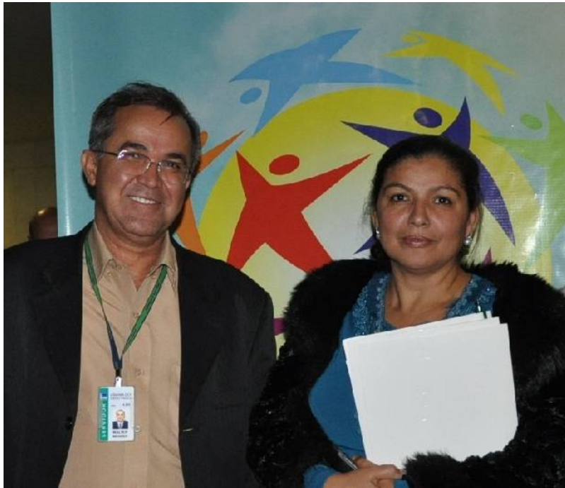
Members at the congress session who said the event was great