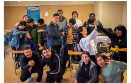
California Chabot College