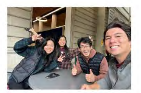
Pennsylvania Community College of Philadelphia