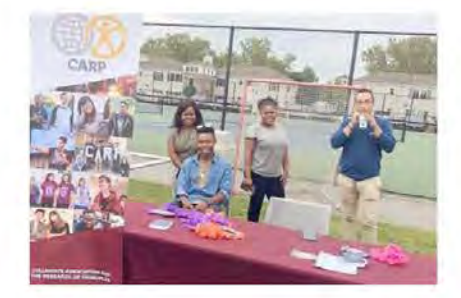
New York Cornell University