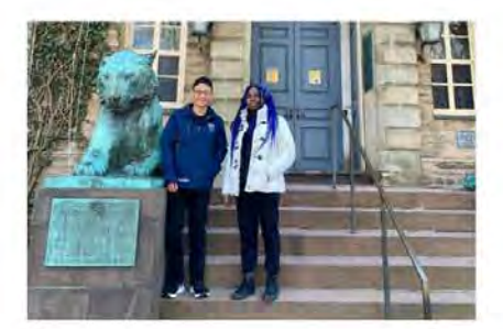
New Jersey Princeton University