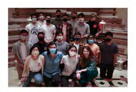
Maryland Montgomery College