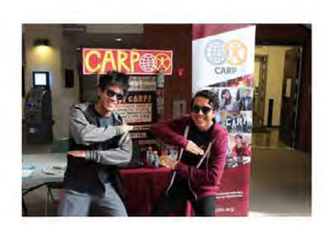
California East LA College (ELAC)