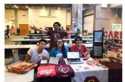
Texas Dallas College, North Lake Campus