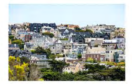
California California State Polytechnic University, Pomona