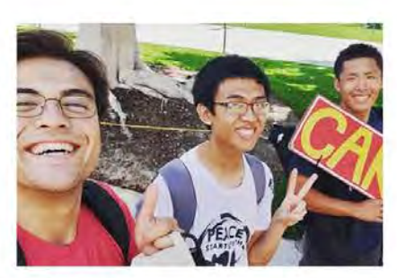
California California State University, Long Beach