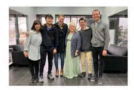
Illinois Harper College