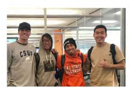
California California State University, Fullerton