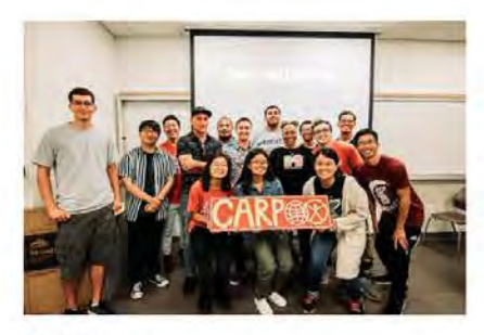
California El Camino College (ECC)