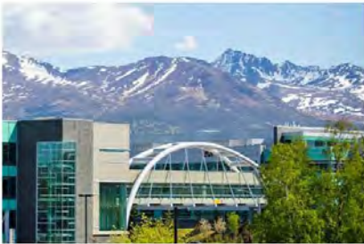
Alaska University of Alaska, Anchorage