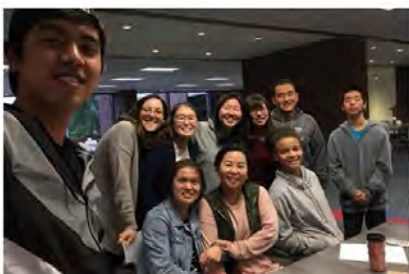
Oklahoma University of Oklahoma