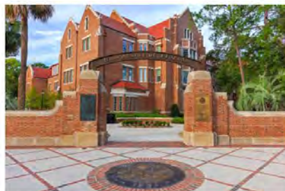
Florida University of Florida