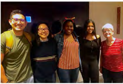
Arizona Arizona State University