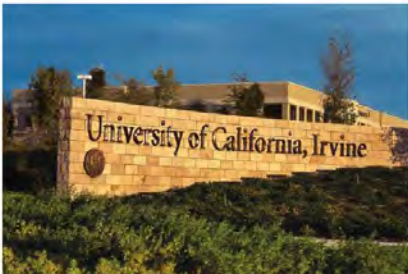
California University of California, Irvine