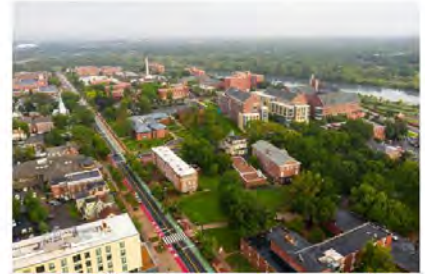
New Jersey Rutgers–New Brunswick