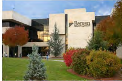
New Jersey Bergen Community College