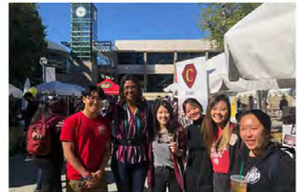
California Pasadena Community College (PCC)