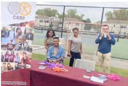
New York Cornell University