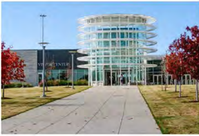
Texas University of Texas, Dallas