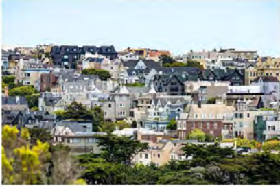
California California State Polytechnic University, Pomona