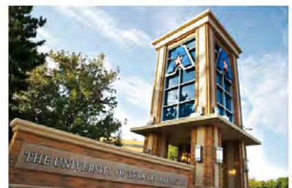
Texas University of Texas, Arlington