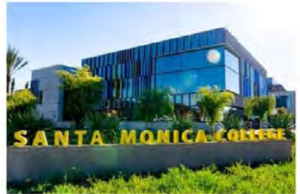
California Santa Monica College