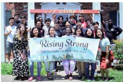
Maryland University of Maryland