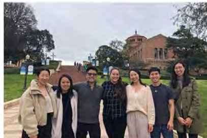
California University of California, Los Angeles