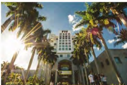
Florida Florida International University