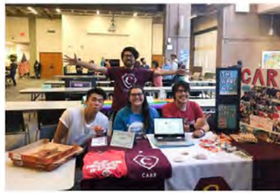
Texas Dallas College, North Lake Campus