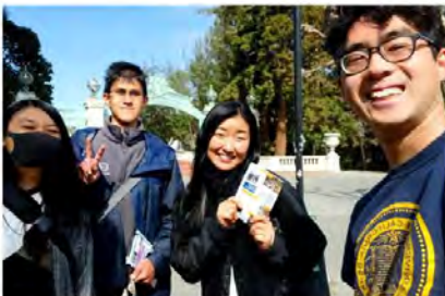
California University of California, Berkeley