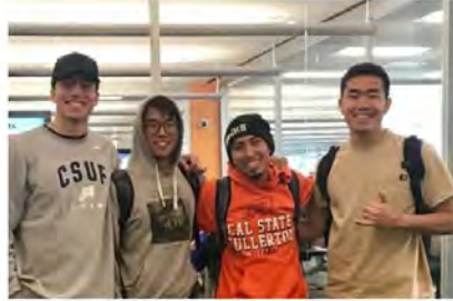
California California State University, Fullerton