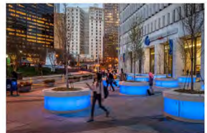
Georgia Georgia State University