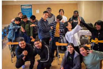
California Chabot College