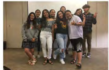
Hawaii University of Hawaii at Manoa