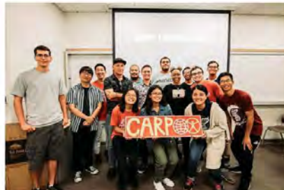
California El Camino College (ECC)