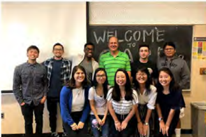
California California State University, Los Angeles