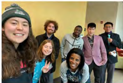
Washington Shoreline Community College