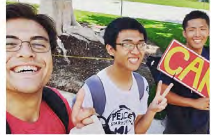
California California State University, Long Beach