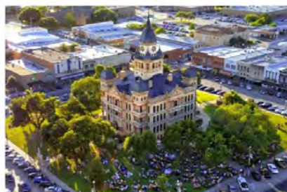
Texas University of North Texas