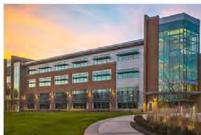
Virginia Northern Virginia Community College