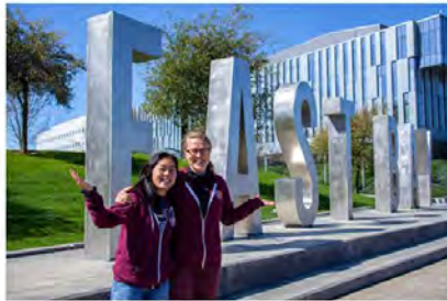
California California State East Bay