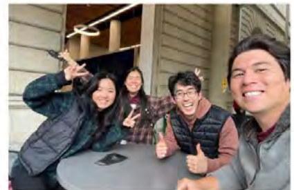
Pennsylvania Community College of Philadelphia