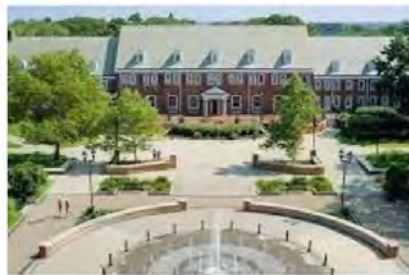
New York Farmingdale State University