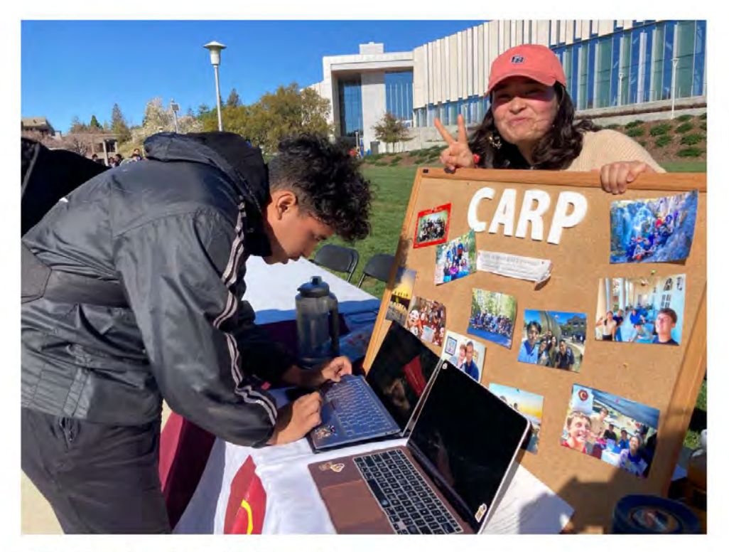
California State University, East Bay; Hayward, CA