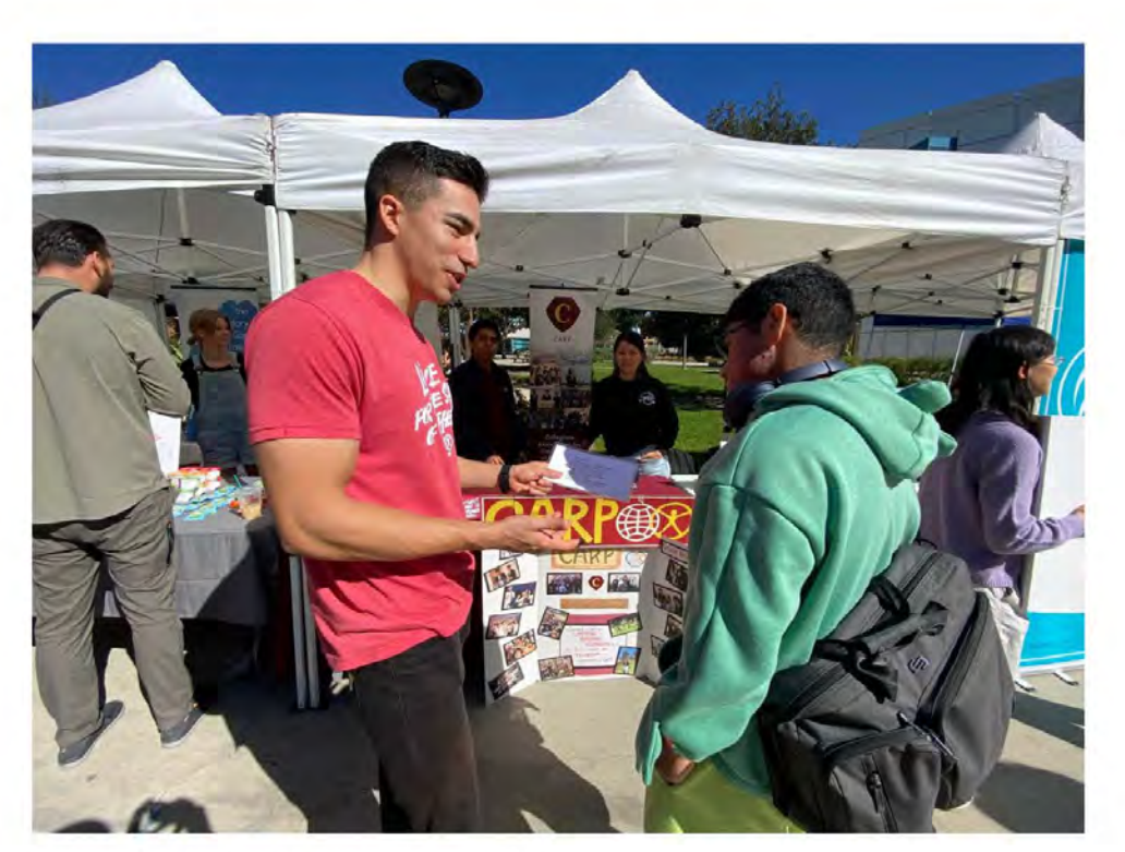
California State University, Fullerton; Fullerton, CA