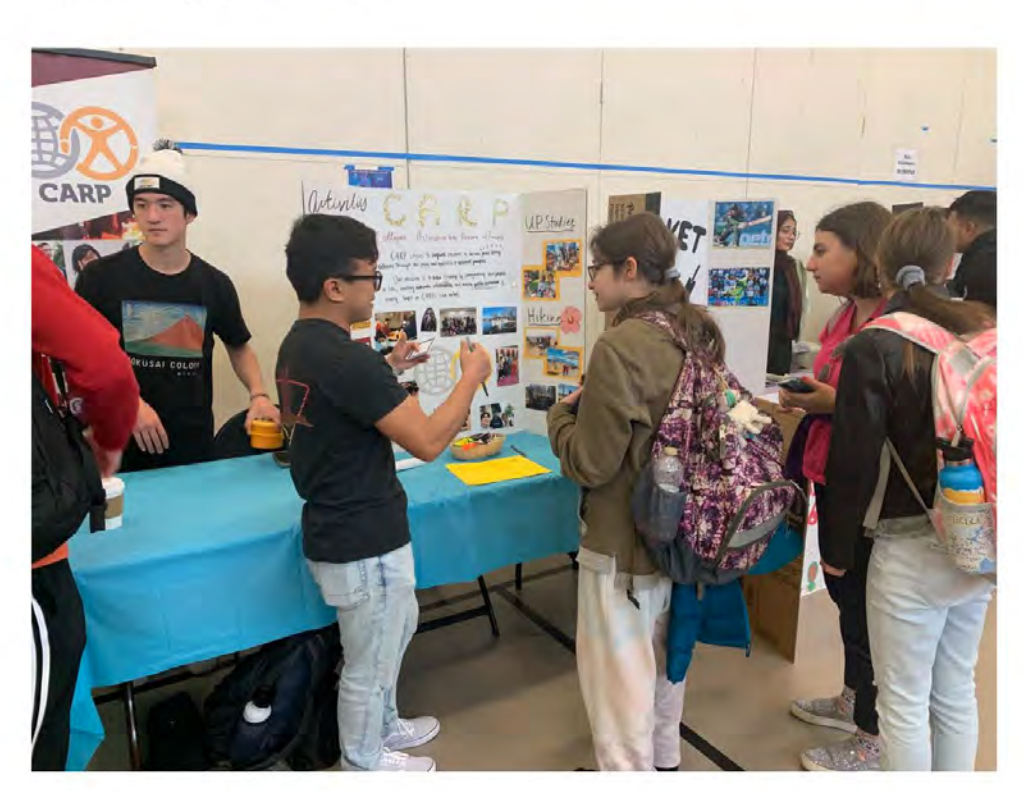
Montgomery College; Rockville, MD

Many CARP chapters around the country kicked off their semester by participating in their school's club fair. By tabling during club fair, CARP leaders are able to introduce their club to their fellow students and get more people involved in CARP activities. They were very successful this year! Check it out: