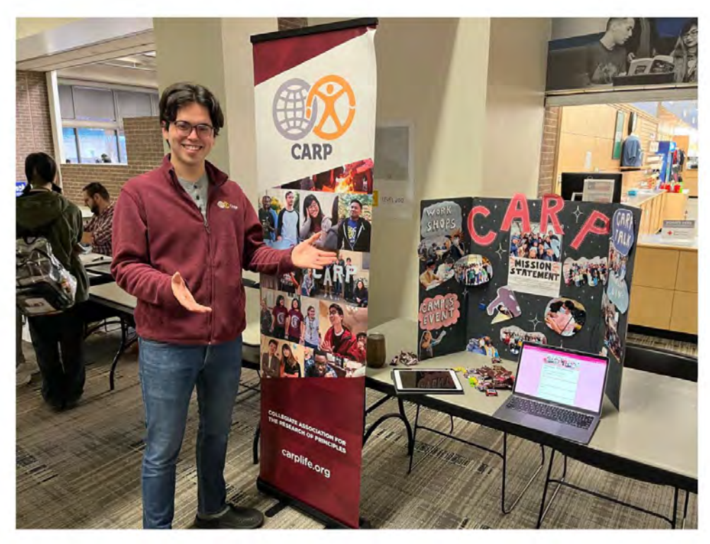
Dallas College, North Lake Campus; Irving, TX