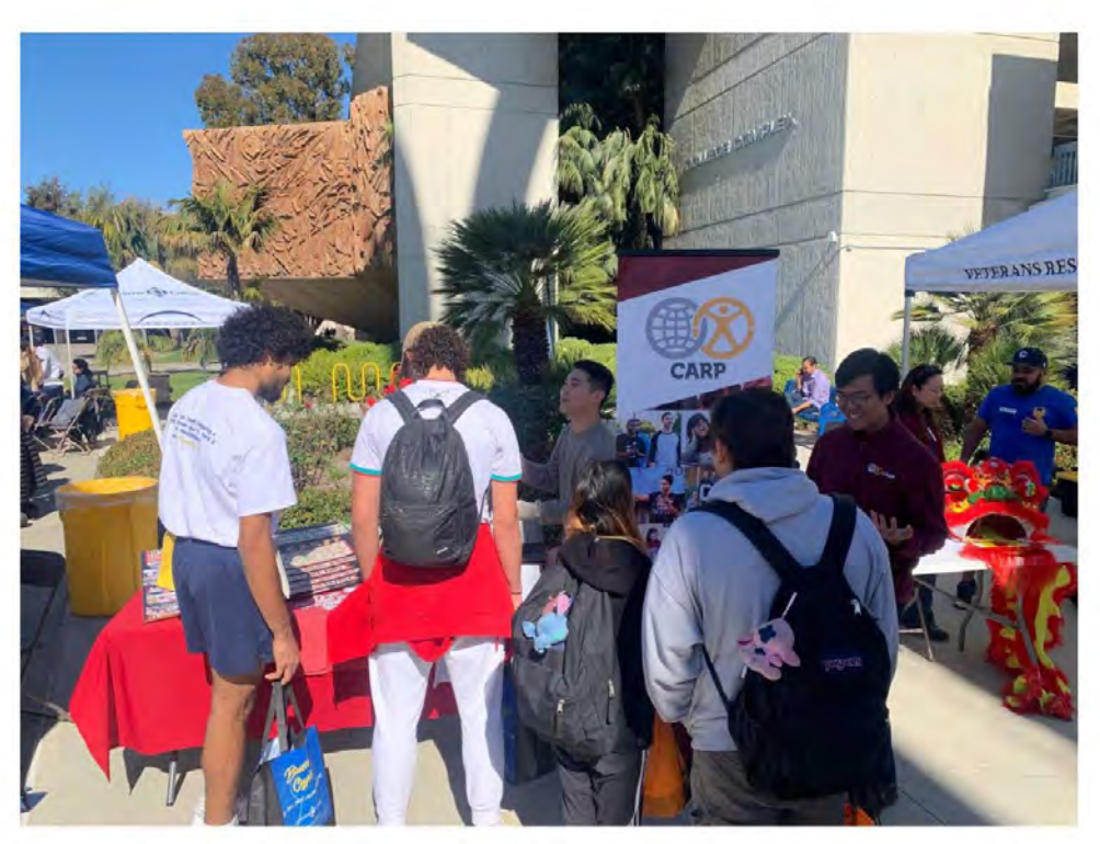
Cypress College; Cypress, CA