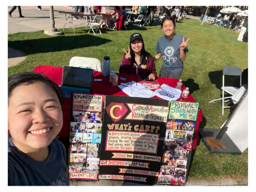
California State University, Los Angeles; Los Angeles, CA