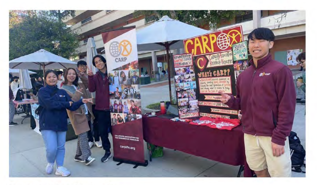
Pasadena City College; Pasadena, CA