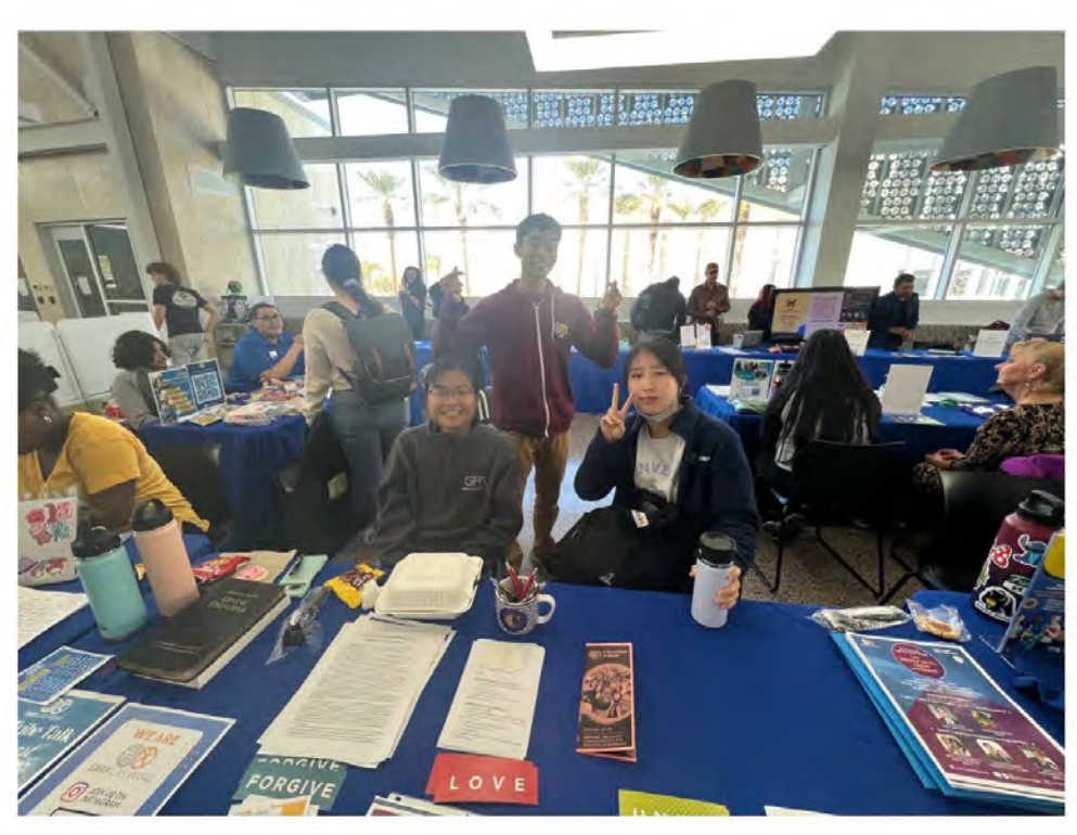
College of Southern Nevada; Las Vegas, NV