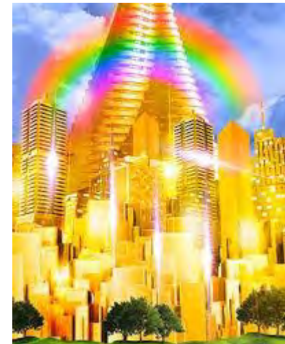
Colossal City in Space Amazingfacts.org