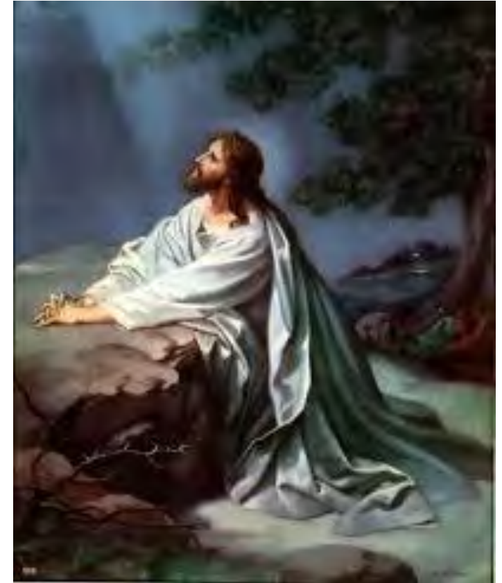
Sorrowful Jesus Trinitybelleplaine.org