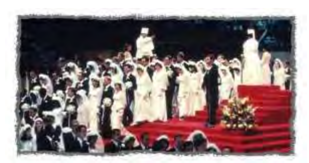
Blessing of 2,075 Couples in Madison Square Garden, NY, in 1982

If and how Singles will follow thru and formalize their newly-formed union, whether by secular and/or religious marriage or any other form of status display, is beyond the scope of this site to take issues with. We just hope to make it easier for Singles to find and court a promising Mr. Right or Ms. Perfect.