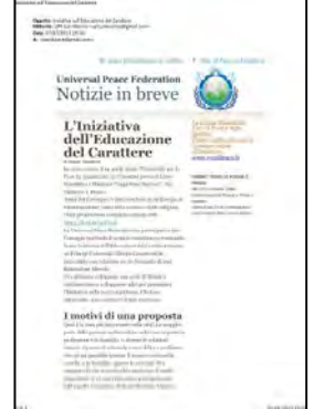
sample of a newsletter

Through this work and my past work with UPF, I have an emailing list of 120 AFPs and Poets(connected with me with 8 years of Poetry Awards, 2005- 2012) and a emailing list of 50 teachers. Then, my reflection since sometimes has been, how can I keep in contact and educate those people?