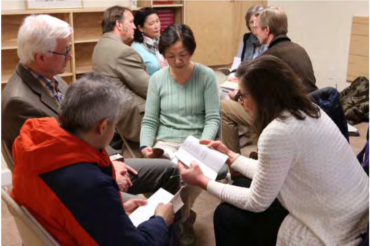
Couples discuss reading assigned during the week in small groups

After the first week, one of the husbands wrote me an email to tell me that he had never realized that other couples went through the same things that he and his wife went through, and learning that helped him to normalize his challenges. I think that is one of the greatest benefits to working on our marriages in a small group environment – we learn from each other, and we help each other laugh at our common weaknesses, encourage mutual vulnerability and support each other's tiny victories.