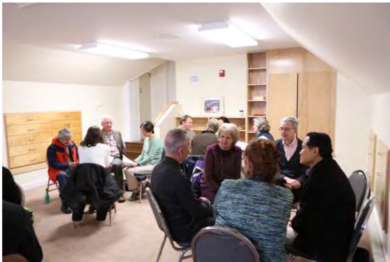
Breakout sessions during the final meeting of the local, six-week program

Since I am the local Blessed Family Ministry representative in Westchester, NY, I thought I would sponsor a six-week small group on marriage and use my book to experience for myself if it can be helpful. I chose to make it 6 weeks, because I know that people are busy and thought it would be less of a commitment with a limited time period. When I was introducing the idea at church, I explained that it could be just as much of a learning experience to attend without a spouse as with, and encouraged people to come anyway.