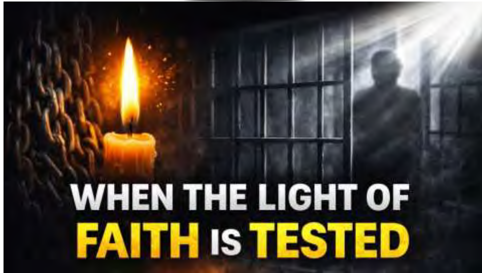
When the Light of Faith Is Tested