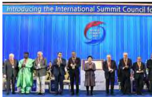
ISCP, Seoul, South Korea