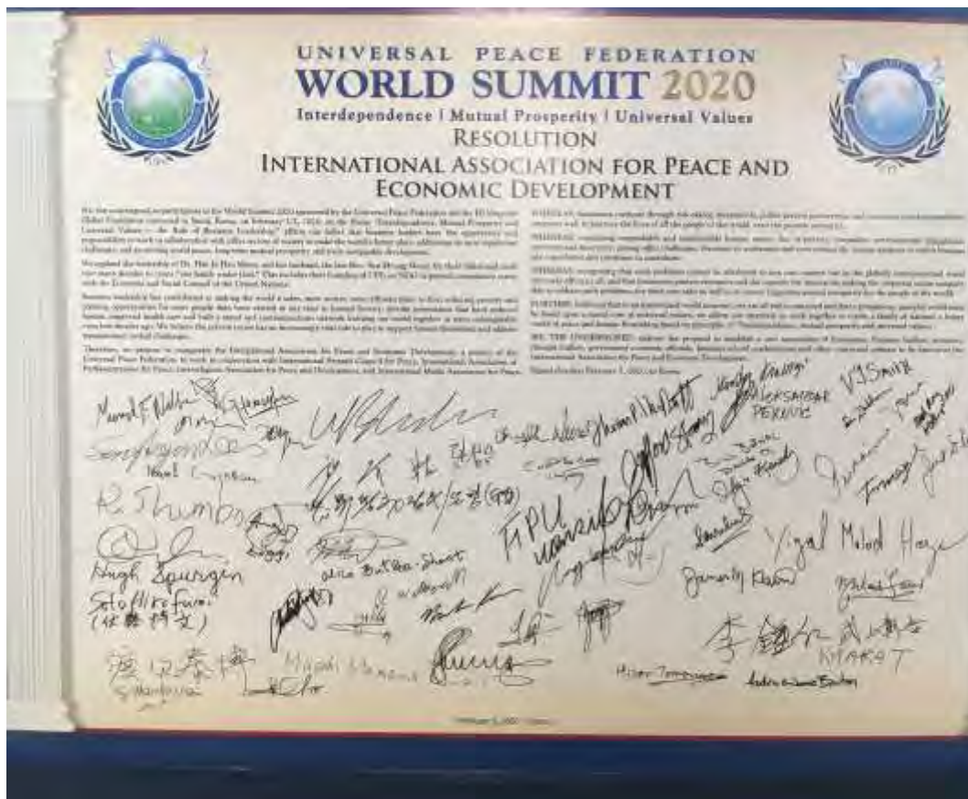
Conference Explores the Role of Business in Peacebuilding, IAED Resolution 2020

As the international community enters the final phase of the Decade of Action, challenges remain, including the long-term effects of the COVID-19 pandemic, ongoing conflicts in regions such as Ukraine and the Middle East, which underscore the need for inclusive peace processes as articulated in United Nations Security Council Resolution 1325 and related frameworks, and slow SDG progress. The 2025 United Nations Sustainable Development Goals Report highlights fragile and unequal progress, with over 800 million people still living in extreme poverty and persistent gaps in data availability for key targets. These findings echo the Pact for the Future, adopted at the Summit of the Future on 22–23 September 2025 during the high-level week of the United Nations General Assembly, calling for renewed multilateralism that UPF advances through its neutral mediation efforts, including in the Middle East. At the same time, technological innovation, civic participation, and youth engagement demonstrate measurable progress, reflected in recent gains in electricity access and disease elimination, and reaffirmed during the SDG Moment 2025 , held on 22 September 2025 during the high-level week of