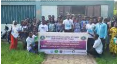
IAYSP Africa Tour, Benin Republic

treating SDGs as direct calls to service, such as through interfaith projects in Asia and Africa. This echoes the founders' view of humanity as one family under God, where service begins in the home and extends to global stewardship, integrating spiritual conscience into SDG efforts such as International Association of Youth and Students for Peace (IAYSP) youth programs without overshadowing practical outcomes.