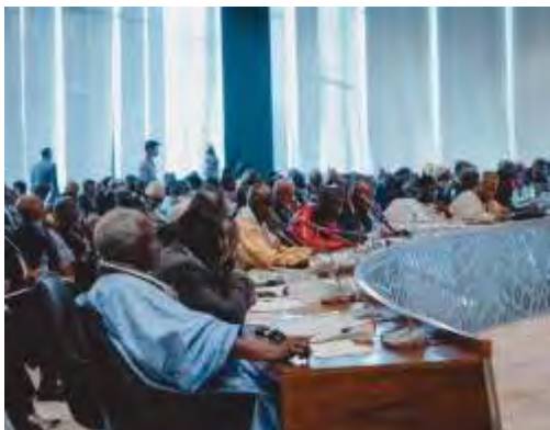
IAPP, Dakar, Senegal

During the Decade of Action, UPF chapters have focused on several priority areas. In relation to Sustainable Development Goal 16 , UPF advances SDG 16 through the International Association of Parliamentarians for Peace (IAPP) and the International Summit Council for Peace (ISCP) , where legislators and heads of state examine constitutional reform and transitional justice, including reconciliation in Africa as seen in recent IAPP assemblies.