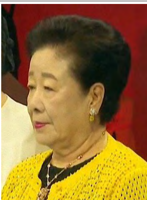
Mother Moon August 23, 2024

When we think about coming to know the heart of God , probably the heart that we most readily associate or think of is God's suffering heart. And sometimes we refer to this as God's heart of the fall.