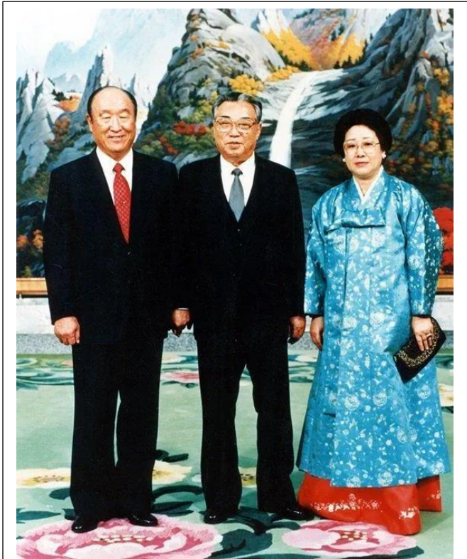
Father and Mother Moon with Kim Il-sung in Hungnam, North Korea Dec. 6, 1991

Now that has not changed and it's something that we can all unite around without fear.