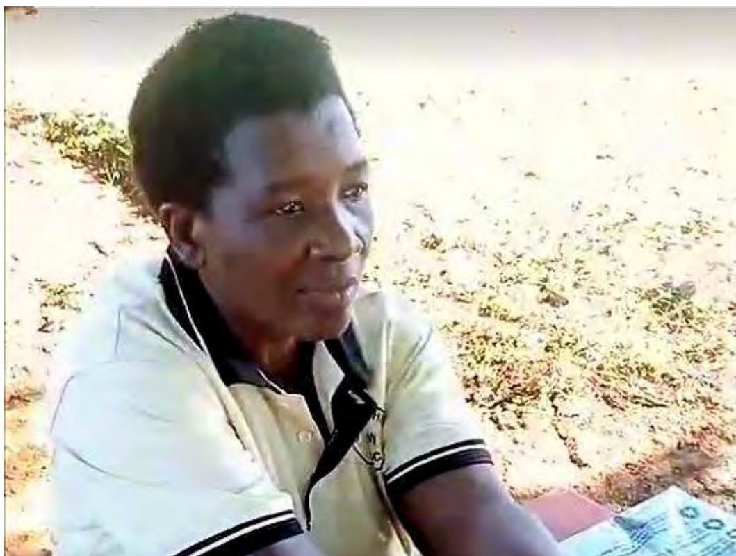
Senior Teacher at Busambala Primary and Secondary School

"Before you came to our school, girls were using rags, paper, and even leaves. Many girls could not even attend school during their periods."