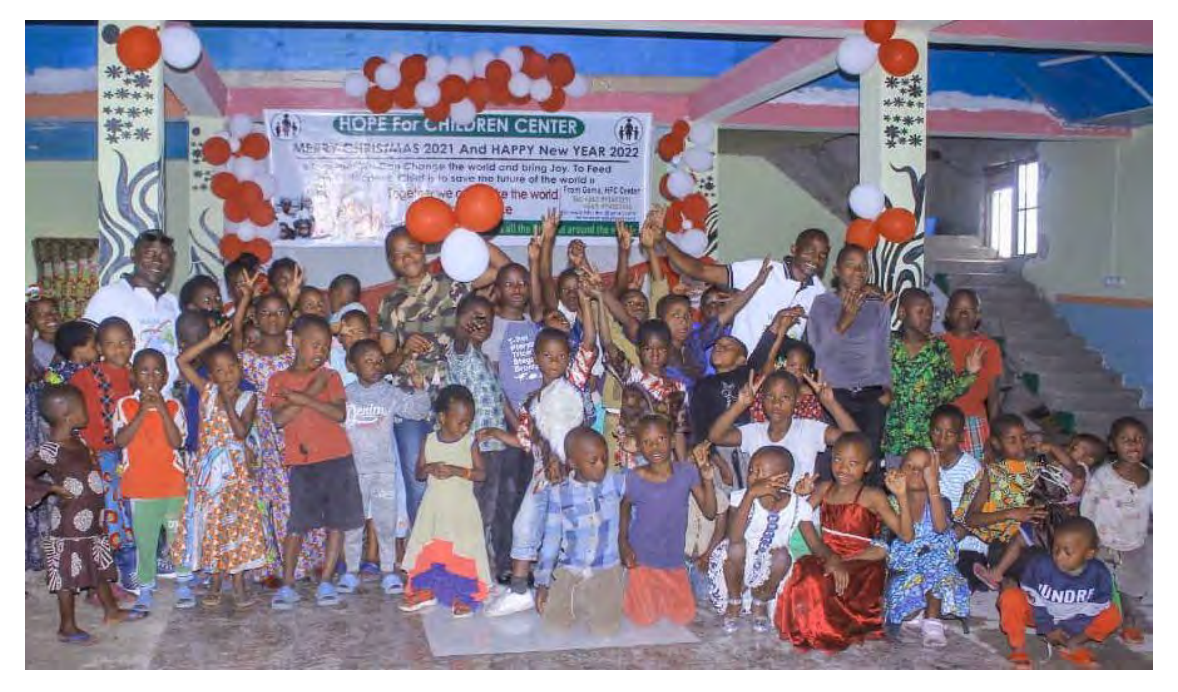
Better days at the Hope For Children centre.

Most of the children are now cared for by foster parents and are attending school as part of the socio-economic reintegration project. The project is supported in cooperation with the UK-based World Cultural Association (WCA).