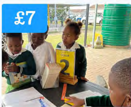
With £7, you can contribute to a child's daily nourishment, ensuring they're ready to learn.