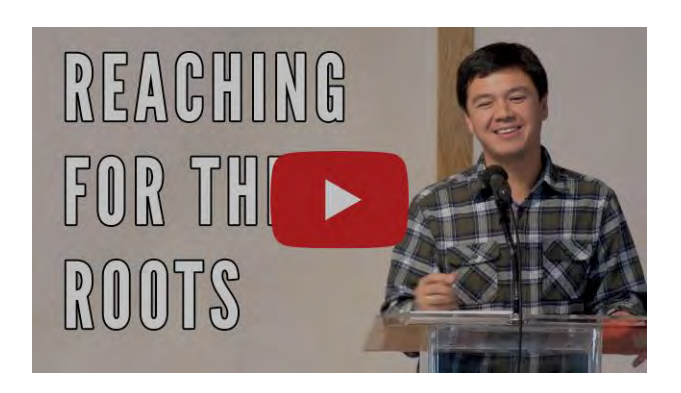
This Week's Announcements