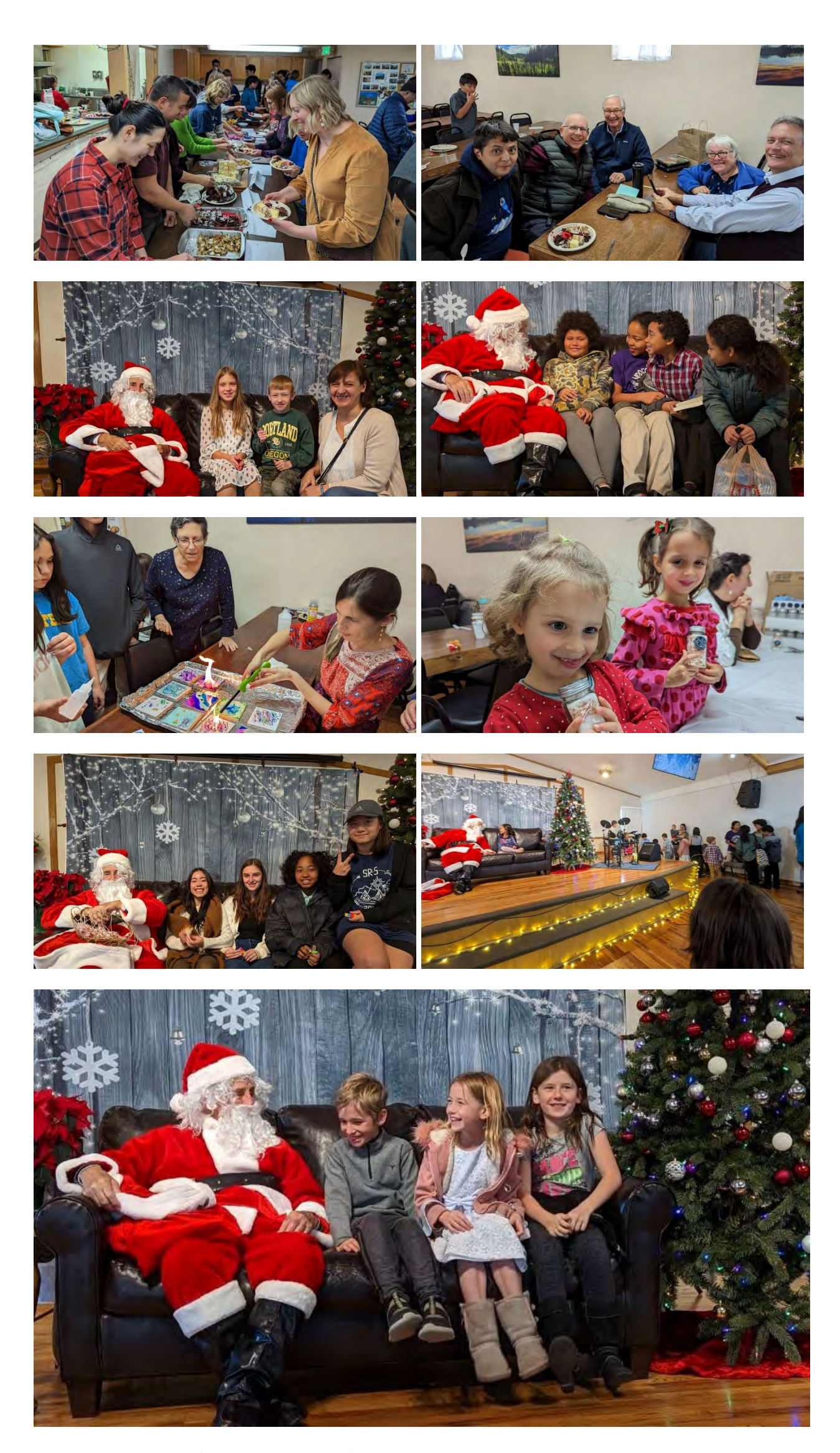
Here are some photos from last week's Christmas Party. A huge thank you to all the volunteers who