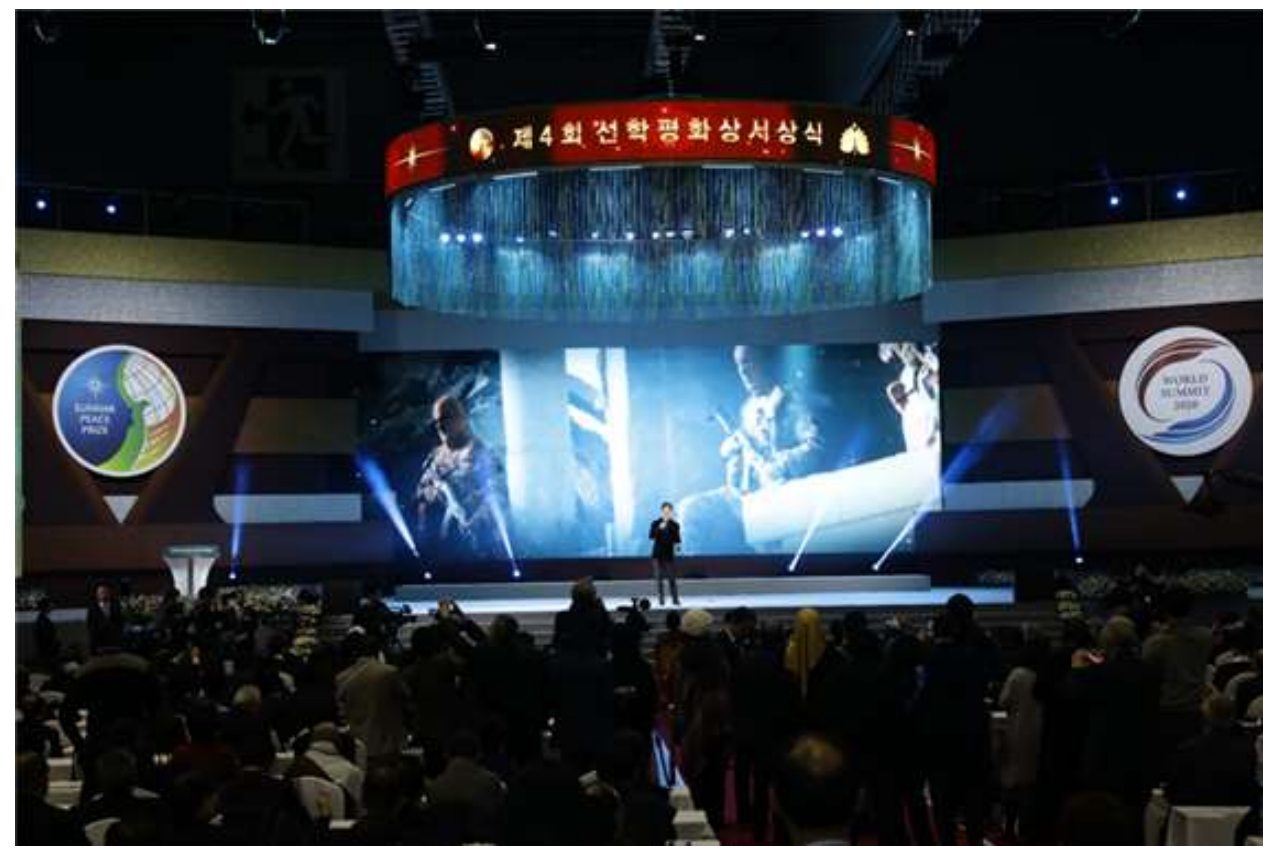
Congratulatory Performance: Musical actress Nam Kyeong-ju