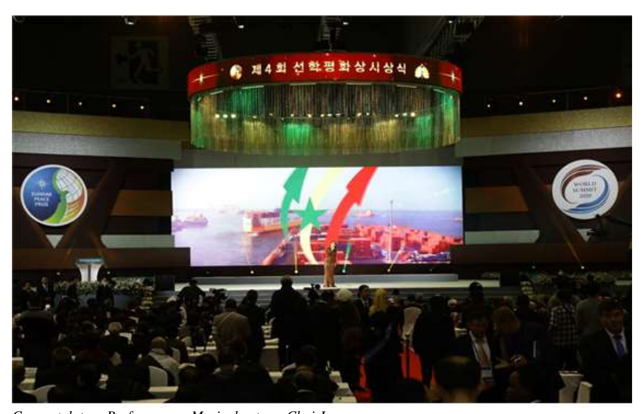
Congratulatory Performance: Musical actress Choi Jung-won