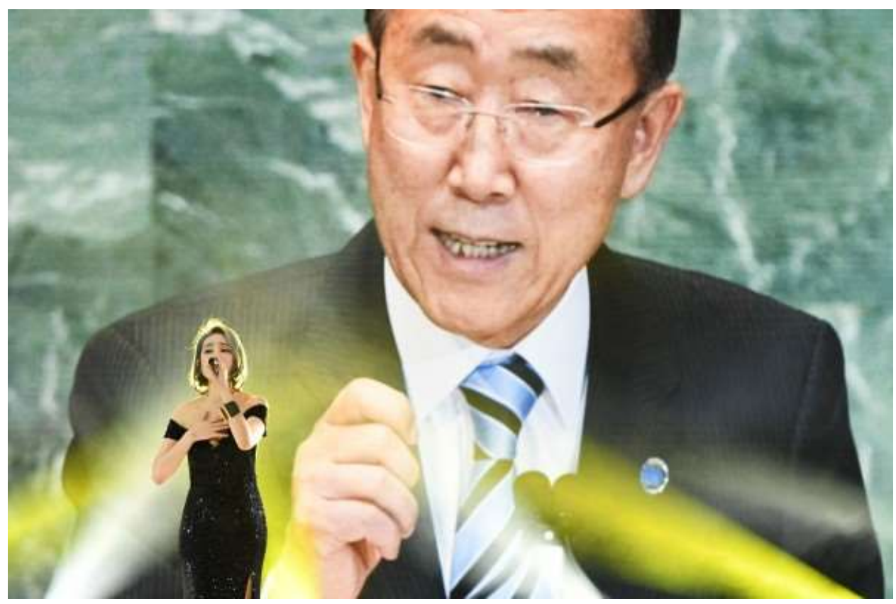
Congratulatory Performance: Musical actress Jeon Su-mi