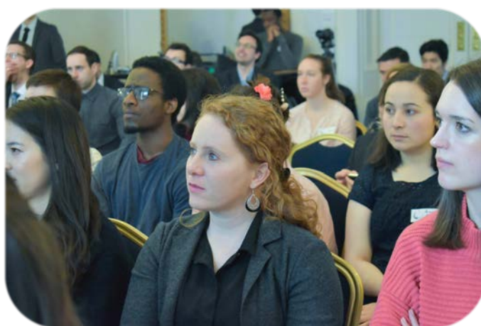
Audience members listening to Keynote speakers