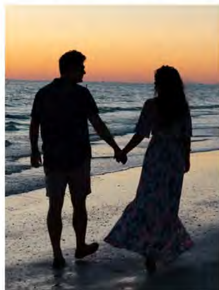
Cropped

The next season of the heart is the experience of conjugal love. It is the horizontal love shared exclusively with a person of the opposite sex, within the bond of marriage. This is the only form of love which includes sexual relationships. Sex is given a paramount importance in our culture, but human sexuality without true love has a bitter taste, and leaves people with various traumas. The physical traumas and risks of casual sex for health are almost benign, compared to the psychological effects.