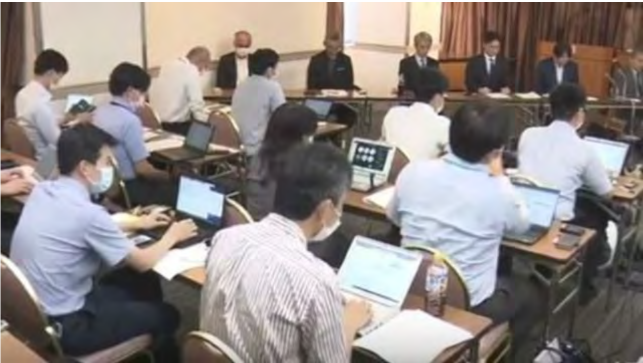
A press conference of the National Network of Lawyers Against Spiritual Sales after the Abe assassination. Screenshot.

All of a sudden, even non-Japanese media after the assassination of Shinzo Abe became familiar with a group called National Network of Lawyers Against Spiritual Sales. The network, now including some 300 lawyers, was established in Japan in 1987 to combat the Unification Church, although it occasionally targeted other religious movements as well.