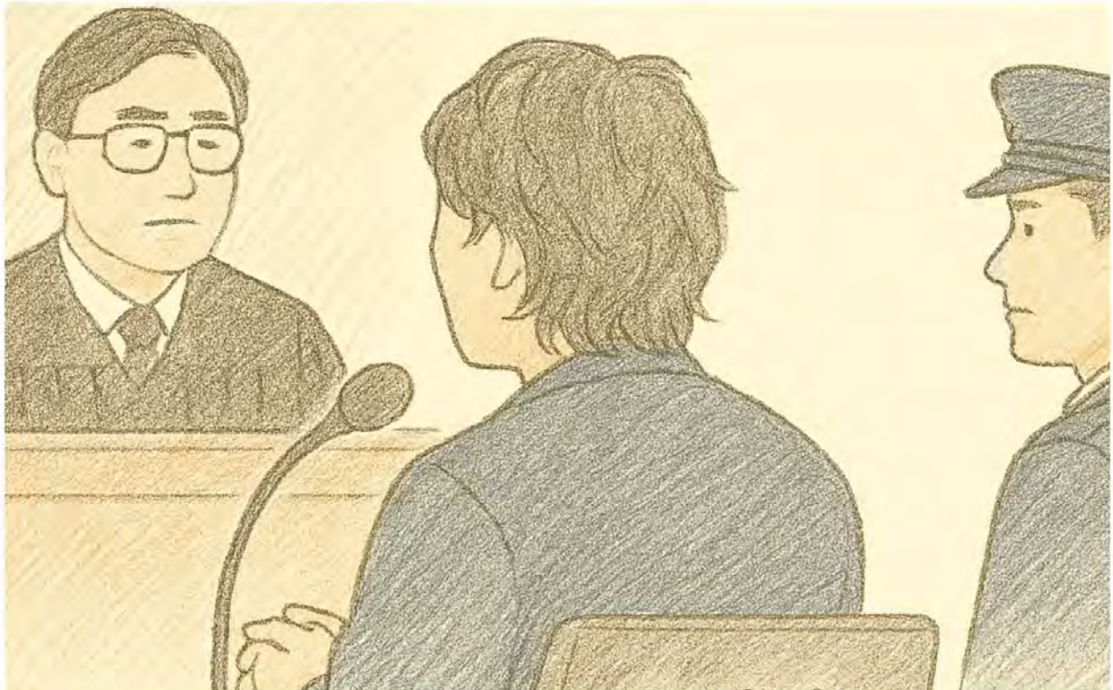
Tetsuya Yamagami in court. AI-generated.

The ongoing trial in Japan of Tetsuya Yamagami, the assassin of former Prime Minister Shinzo Abe, has stunned me in many ways and prompted me to put pen to paper.