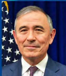
GUEST PANELIST Adm. Harry Harris

A belligerent North Korea, aligned with Russia, China, and Iran creates a volatile chemistry