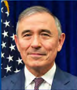
GUEST PANELIST Adm. Harry Harris

A belligerent North Korea, aligned with Russia, China, and Iran creates a volatile chemistry