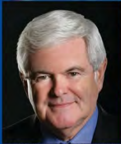
GUEST PANELIST Speaker Newt Gingrich

Speaker Newt Gingrich's Take on the Asia Pacific Difficult and frightening questions need to be addressed