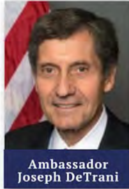
Ambassador Joseph DeTrani

National security columnist, The Washington Times; author