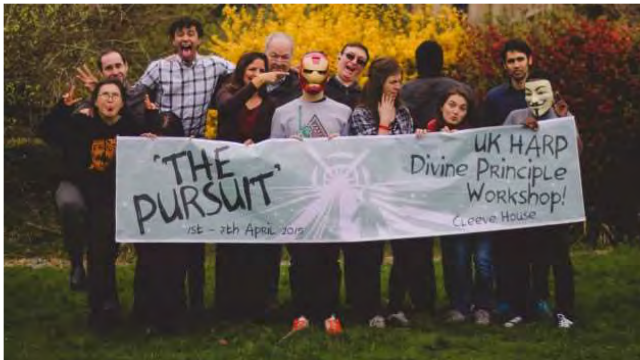
Divine Principle Workshop 2015

Do you want to offer some time to our younger second generation this Easter whilst nourishing your heart and soul with lots of wonderful Divine Principle content?