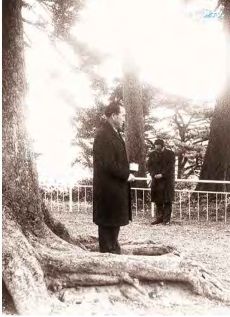
The Founding of Sunhwa Academy January 30, 1976, Seoul, Korea

Sunhwa Academy was founded at 25-beonji Neung-dong, Seongdong Borough, Seoul on January 30, 1976. Thanks to the establishment of the school corporation, Sunhwa Academy, Little Angels Arts School, was able to gain a stable foundation for management. On February 8 of the next year, the first class of Little Angels Arts School graduated, and its name was changed to Sunhwa Arts School on the 16th of the same month. Sunhwa Arts High School was established the following March 4 and it has now nested itself in the society as the mecca of arts education with forty years of history.