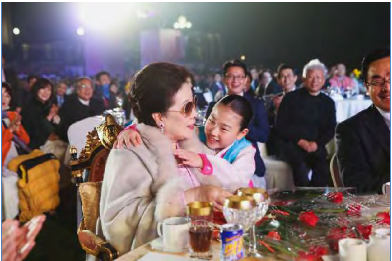
A Little Angel gives True Mother a hug

She also said that every problem we encounter can and should be resolved with True Parents, and this is the conviction that will give us the confidence to go out into the world and share about True Parents. After her main address, True Mother offered a toast and then made her way to one of the many dining tables dotting the lawn. Everyone present shared a meal, and soon after, lively entertainment ensued.