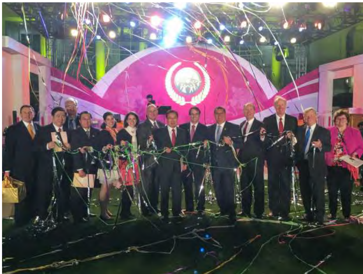
The FFWPU USA National Ministry Team