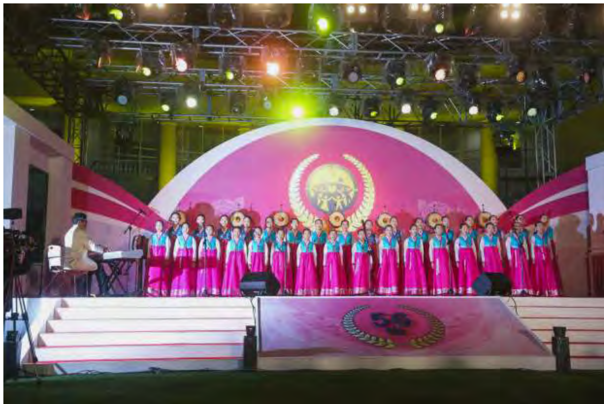
The Little Angels sing for True Parents' Holy Wedding Anniversary

continuous dedication to their mission and vision.