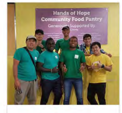
August 17, 2019 @ Catholic Charities of Southern Nevada with International Leadership Training Program (ILTP)