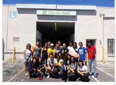
July 25, 2015 @ Clean the World