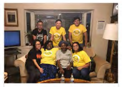
July 24, 2021 @ Harrison House