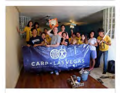
August 22, 2014 @ CARP Las Vegas House