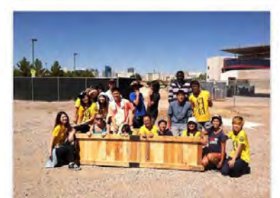
October 13, 2018 @ Las Vegas Wash with Generation Peace Academy