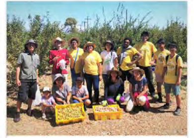
August 6, 2022 @ Ahern Orchard