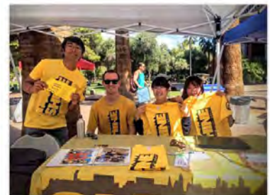
September 2, 2015 @ UNLV Involvement Fair