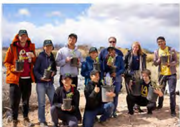
March 2, 2019 @ Las Vegas Wash