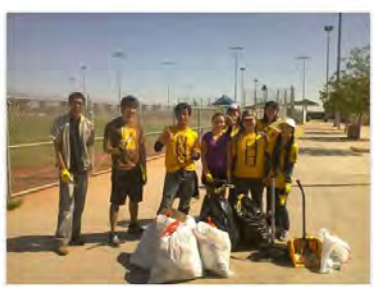
April 26, 2013 @ Lorenzi Park