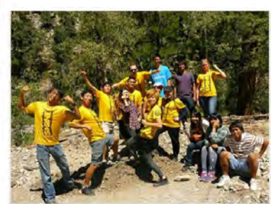
August 15, 2014 @ Mt. Charleston