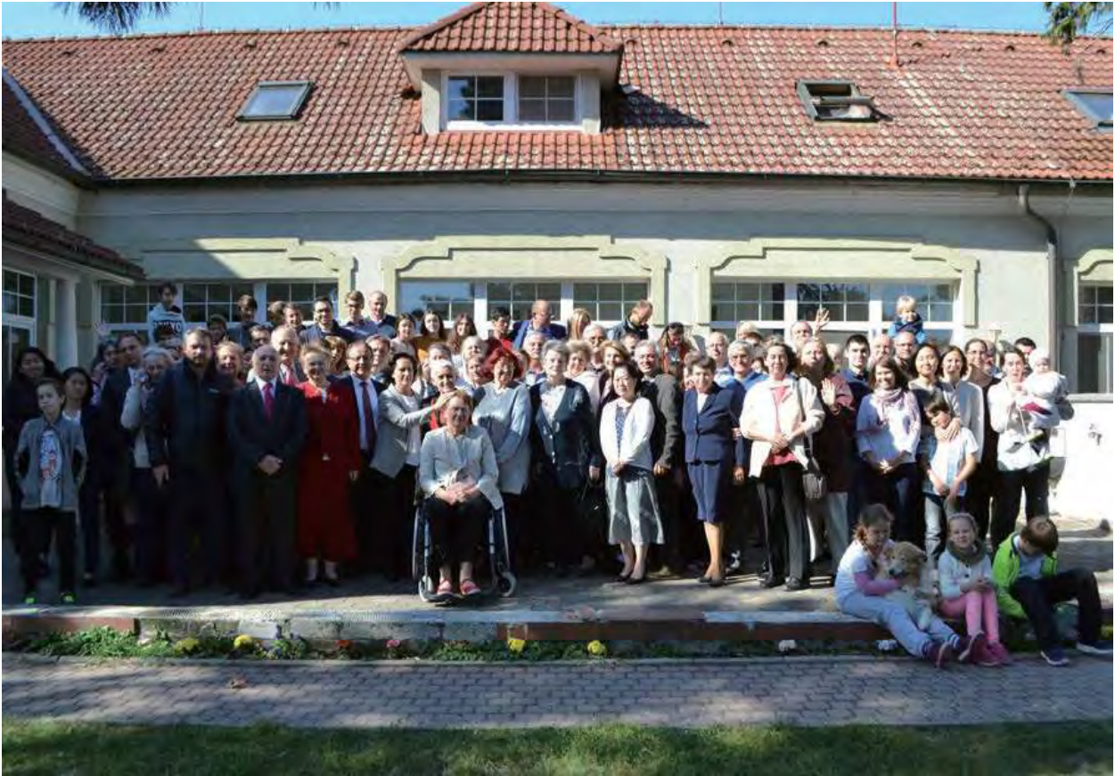
Members today of FFWPU in Slovakia and the Czech Republic recognized fifty years of faith and perseverance