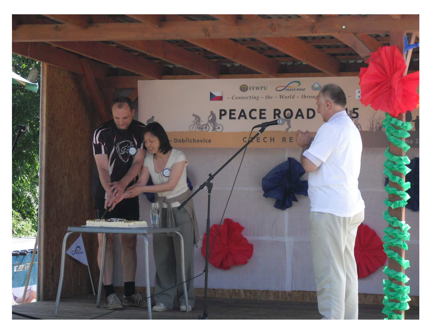
Cutting the Victory Cake.