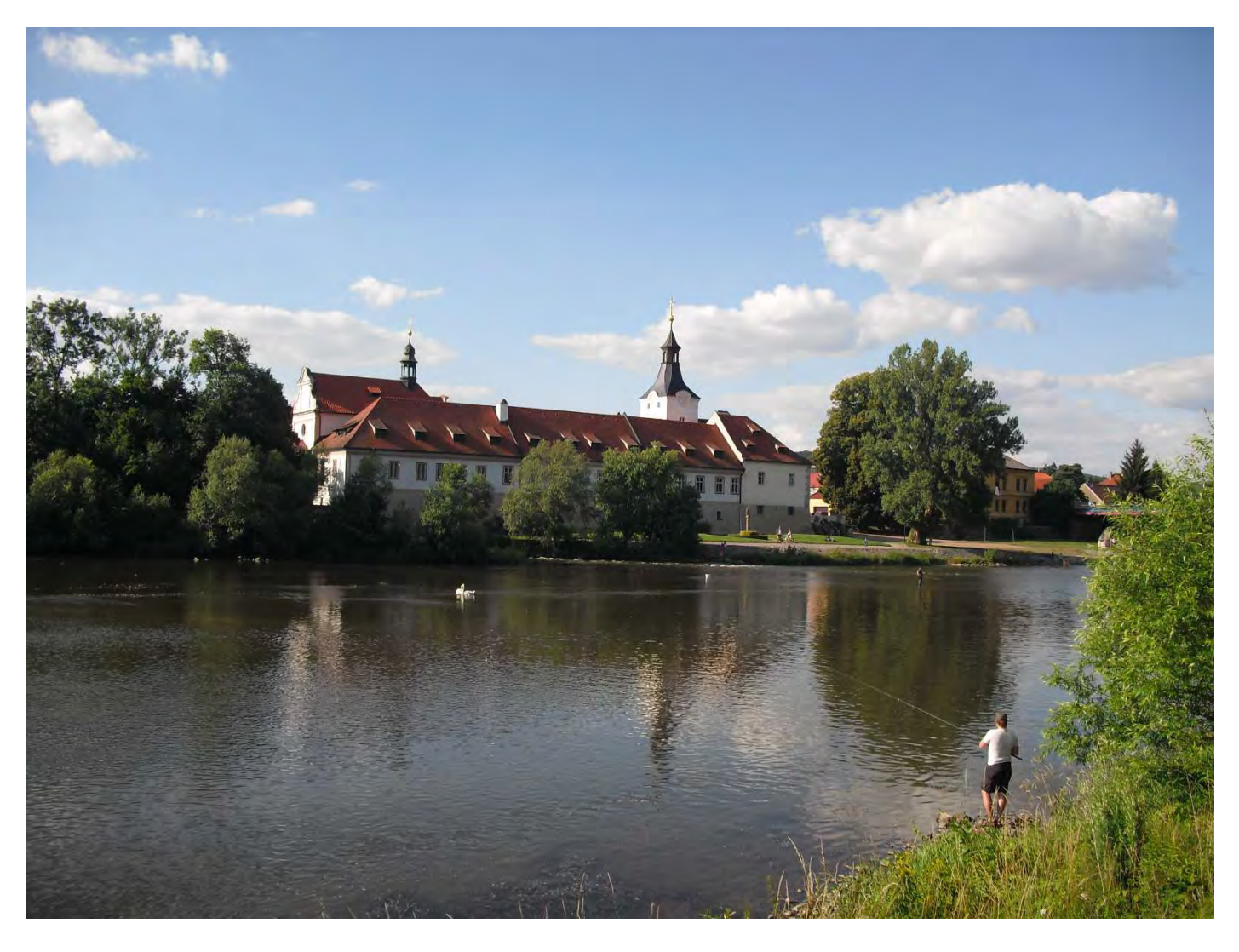
Town of Dobřichovice.