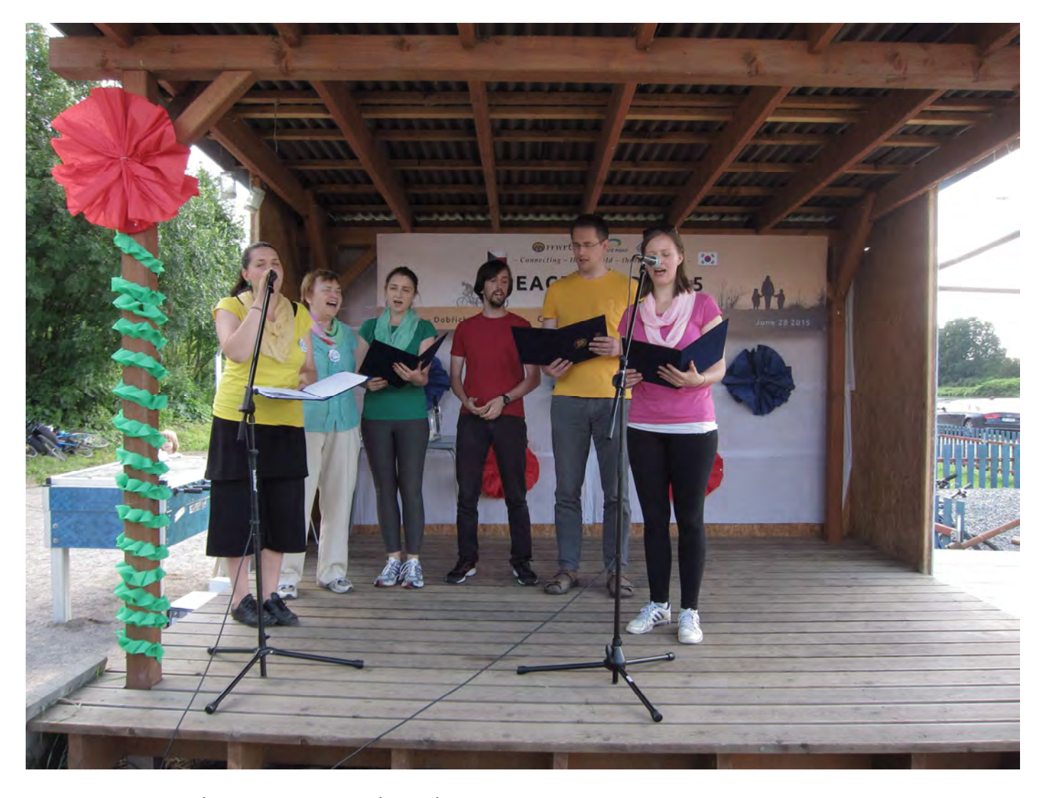
Our Music Ministry choir sang Arirang and Tongil.