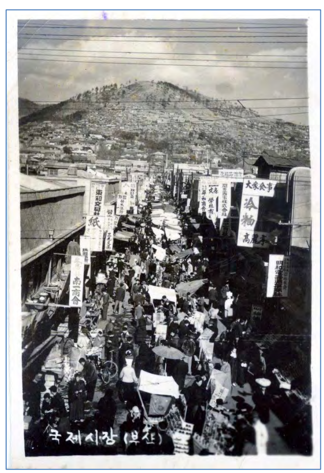
A market in Busan, another black and white photos that they sold and would have made into color photos if asked.

But what is that? I would say it was a luxury. From the first day, a woman who was the owner of the largest sample photo in a frame showed up and demanded that it be returned, claiming it was her photo. No matter how hard I tried, I couldn't describe the feeling of despair I felt after returning the photo. It became normal to see me in the soup kitchen of Sejemun Church every evening. I didn't have enough money to cook for myself. My lunch was one or two donuts bought on the street.