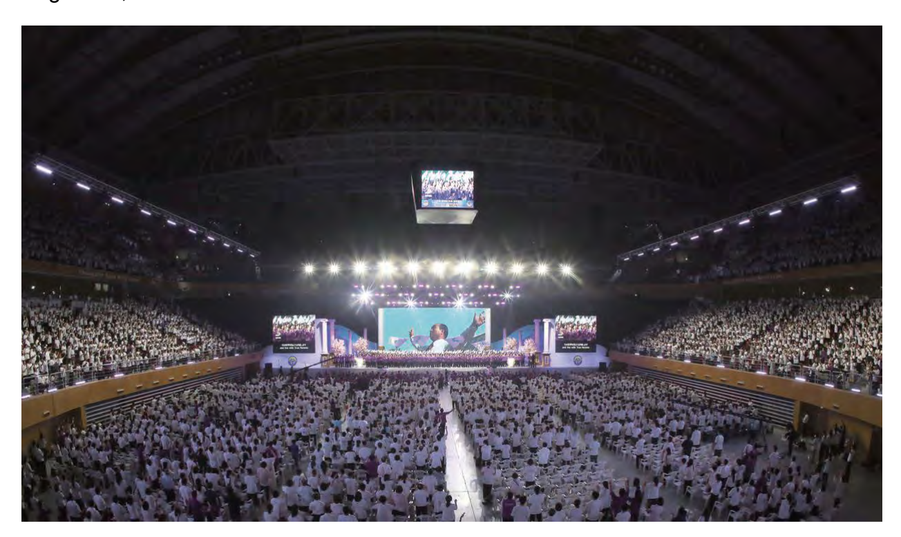
The "Hyojeong CheonBo Great Works" was held from August 23 to 25 at the CheonBo HJ Training Center and HJ Complex. Members from all over the world participated in an attempt to victoriously enter Cheon Il Sanctum in Cheon Won Gung in 2025 and inherit the heavenly fortune based on the cosmic-level victory of the True Parents.

The first day began with the opening ceremony, Chanyang, and special meetings in the prayer hall, providing members with an opportunity to grow and mature in their faith. In the afternoon, the "Resolution Gathering for Victorious Entry into Cheon II Sanctum in Cheon Won Gung" and the "1111th Cheon Shim Won Special Vigil Prayer" allowed participants to resonate with the hearts and words of True Parents, strengthening their determination for the Cheon II Sanctum Entry Ceremony in Cheon Won Gung and the establishment of a unified heavenly Korea.