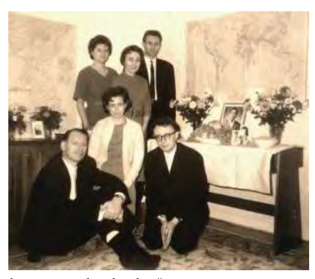
has continued to this day."