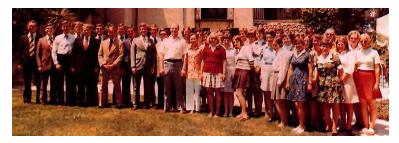
From 1992 True Mother toured to all parts of Europe and guided their revival.

that True Parents threatened national security, the Schengen Agreement nations blocked the way of Heaven's providence, hurting True Parents' hearts and causing European members to feel ashamed.