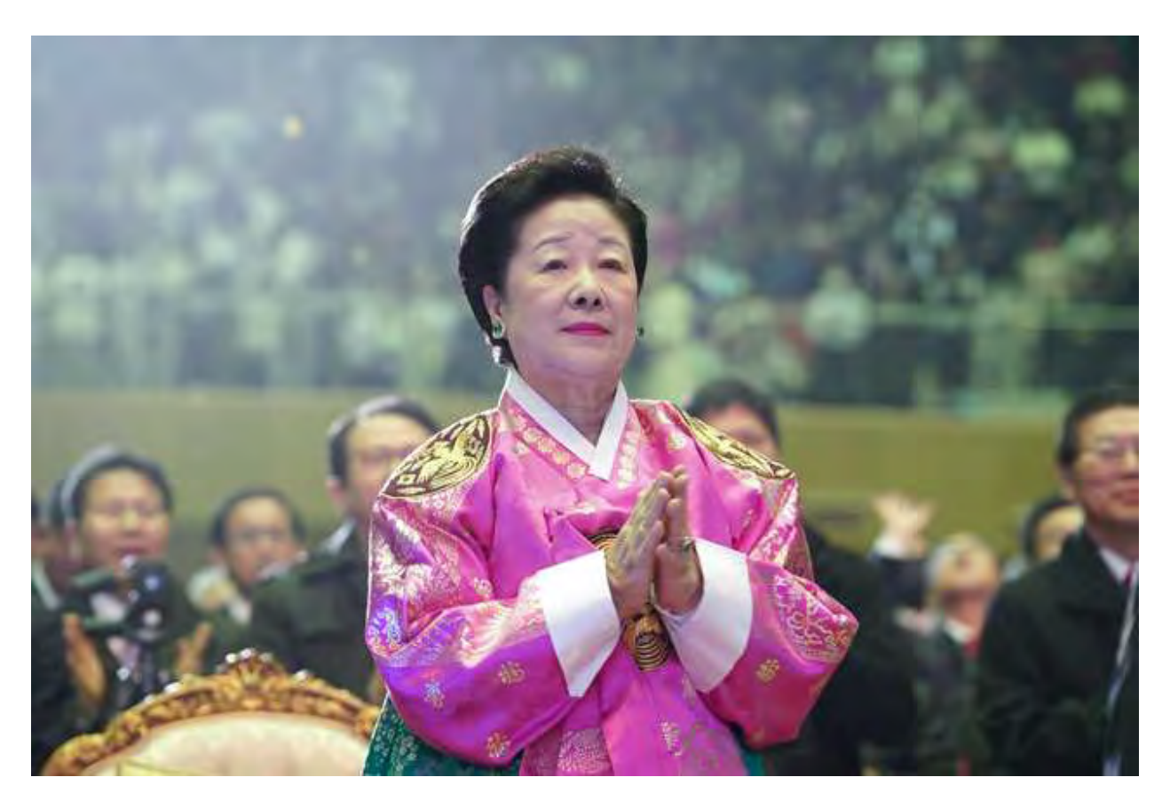
"When I saw the death of the missionary who, in his moment of demise, said 'Please forgive this son who dies before his parents,' I felt a searing pain from the deepest depth of my heart. Seeing True Father's tears falling endlessly, I did the same."