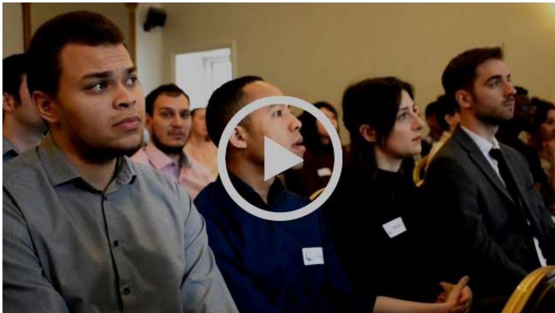
Cranes Club London - A Look Back by Samuel Read

Take a look back at the annual conference in London