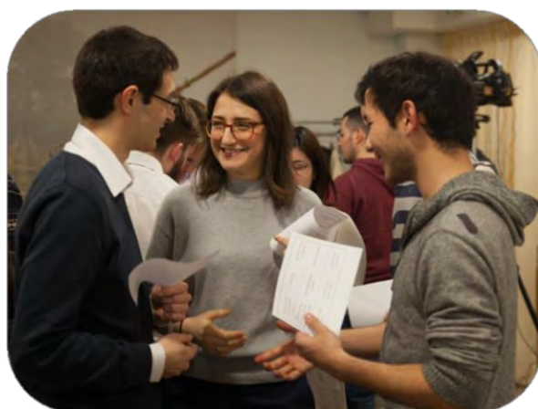
Participants getting to know each other during the first evening.