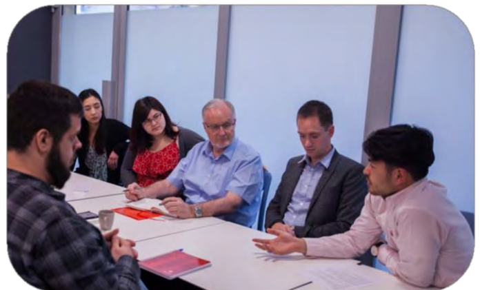
Lively discussion during the networking session.

There was a networking session in smaller groups meeting by area of interest, which included: business and finance, creative industries, science and technology, medicine and health, education and social work, policy and society. During this time participants could share about their personal interests and experiences of the professional environment, having the opportunity to meet new people, build connections, and have passionate discussions on topical issues.