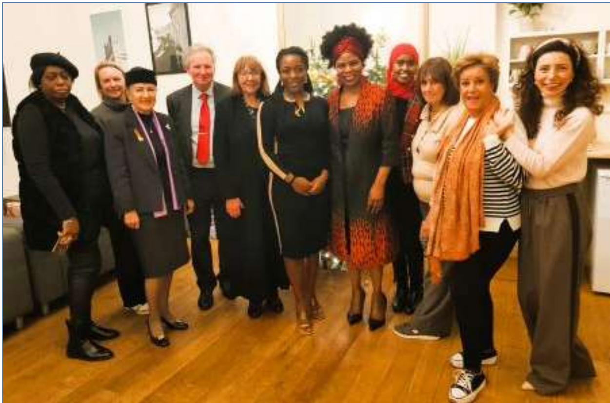
Elimination of Violence Against Women – 'Unsilenced' Film Screening at Universal Peace Federation - UK

Organised by the National Association of Women's Organisations and the Justina Mutale Foundation