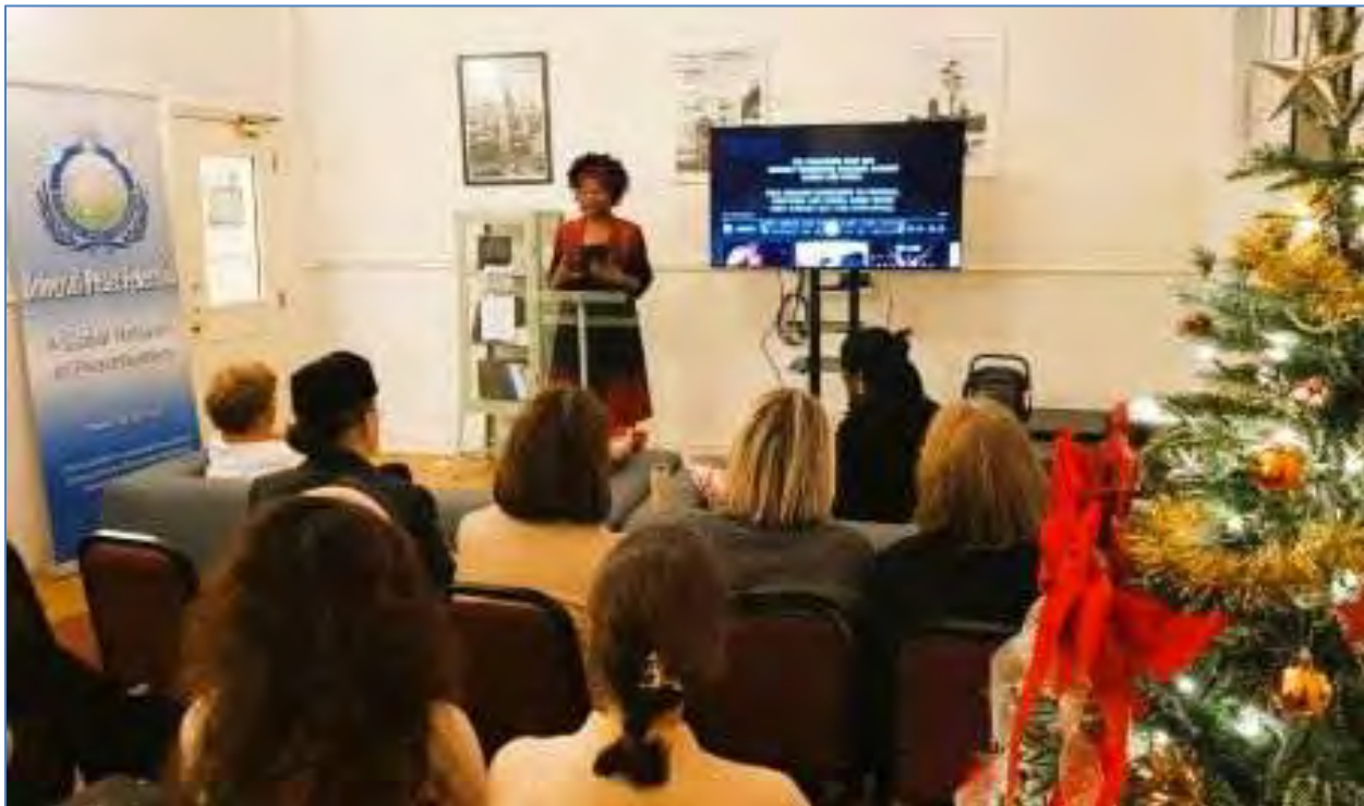
As part of the UN 16 Days of Activism Against Gender-Based Violence, the Universal Peace

Advocating Dignity, Safety and Human Rights for Women and Girls 9 December 2025 | 43 Lancaster Gate, London