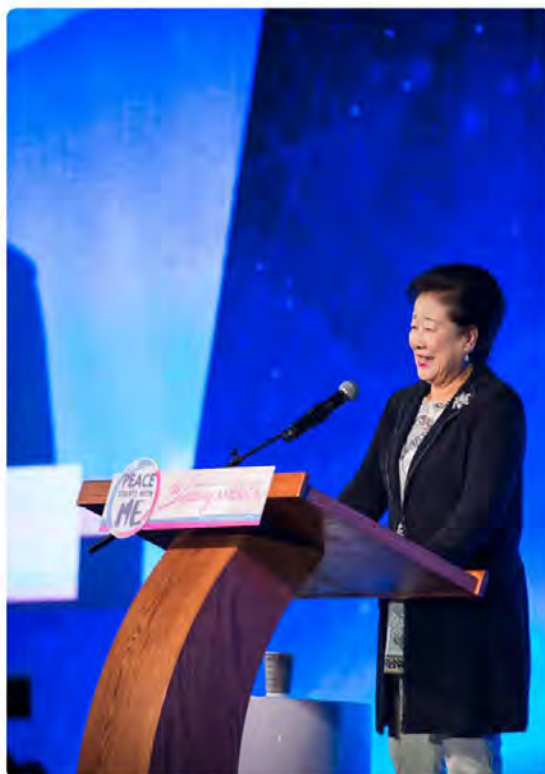
Dr. Hak Ja Han Moon, the Mother of Peace, delivers an inspiring message on faith, family, and global harmony.