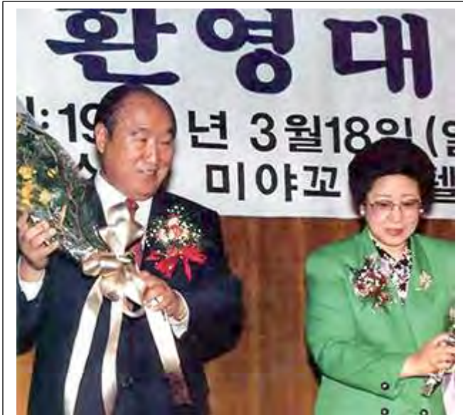
True Parents receive flowers at the San Francisco public speech to the Korean community on March 18, 1990

True Father launched his first U.S. speaking tour since the 1970s, addressing Korean communities in five U.S. cities, beginning in San Francisco on March 17, 1990. The other cities were Los Angeles, Chicago, Washington, D.C., and New York, and True Father said the five cities represented the 50 states of America. True Father spoke on the topic “True Unification and One World.” The events were promoted as “Welcoming True Parents Rallies.” They served to introduce True Parents’ activities and thought to Koreans in America and to familiarize the Korean community with the term “True Parents.” True Father had conducted “Welcoming True Parents” rallies in five Korean cities the previous month. These rallies were part of the lead-up to the Moscow Rally in April 1990 and True Parents’ declaration of their roles on the worldwide level.