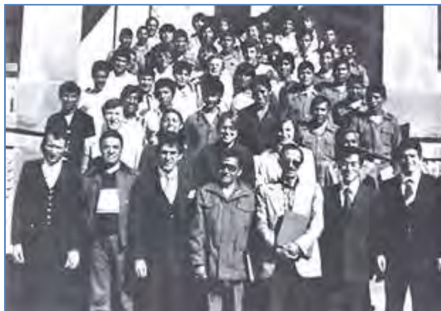
Shortly after its launch, CAUSA holds a workshop for students in Bolivia