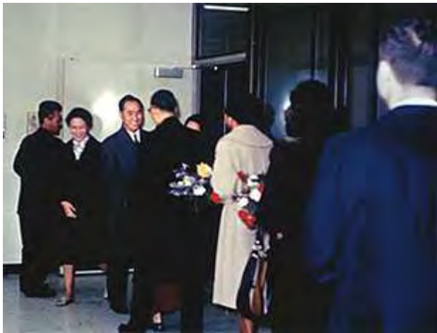
True Parents at the Los Angeles airport