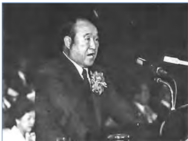
True Father delivers the Citizens' Federation Founder's Address

The "Danbury Course" was decisive in sparking widespread grassroots support for True Father across the United States from minority communities and those concerned about religious and civil liberties. In fact, a broad spectrum of 1,600 clergy and prominent laypeople welcomed True Father back from prison at a "God and Freedom" banquet held in his honor at the Omni Shoreham Hotel in Washington, D.C. A similar event occurred in Korea on December 11, 1985, when some 2,300 dignitaries from a diversity of fields, including a former prime minister of the Republic of Korea, attended a welcoming banquet at the Hilton Hotel Convention Center to pay tribute to the conclusion of True Father's 40-year ministry and to