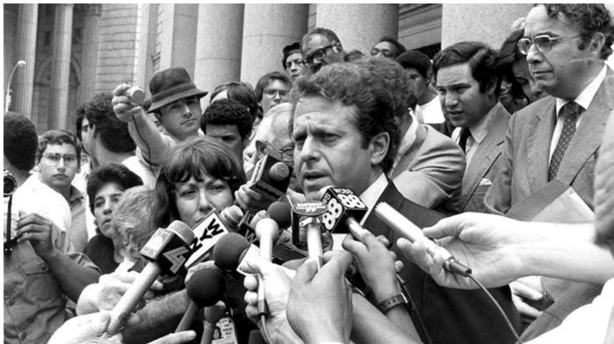
Harvard Law scholar Lawrence Tribe speaking on True Father's court proceedings at the Federal Court House in New York

In his book Inquisition, The Persecution and Prosecution of the Reverend Sun Myung Moon , Pulitzer Prize-winning journalist Carlton Sherwood argued that True Father's 1981 conviction on tax evasion charges was the result of "the most intensive and expensive criminal tax investigation of any religious figure in U.S. history." However, the conviction had the effect of generating broad-based public support for True Father. By April 1984, forty groups and individuals representing more than 120 million Americans had filed amicus curiae briefs in support of his appeal, including the National Association of Evangelicals, the National Conference of Black Mayors, the National Bar Association, The Church of Jesus Christ of Latter-day Saints, the attorneys general of Hawaii, Oregon and Rhode Island, Eugene McCarthy and Clare Boothe Luce. The Supreme Court's refusal on May 14, 1984, to review True Father's petition, despite this groundswell of support, set off a series of "Rallies for Religious Freedom." Even The Washington Post , no friend of the church or the competing Washington Times , editorialized that "the case deserves attention and full Supreme Court review." Ironically, the church emerged from True Father's conviction on more solid ground than it had been before.