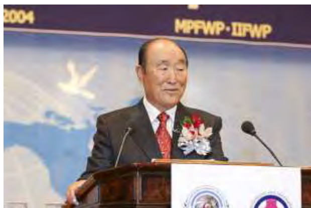
True Father speaks at the International Peace Conference for Mongolian Leaders from Around the World

True Father established numerous Federations for World Peace following the end of the Cold War and into the new millennium. From September 21-24, 2004, the first International Peace Conference for Mongolian Leaders from Around the World took place in Seoul. This conference led to the creation of the Mongolian Peoples' Federation for World Peace (MPFWP). True Father defined Mongolian peoples as those born with the Mongolian birthmark, a bluish mark usually seen on the backside. He asserted that nearly three-quarters of the world's population is linked to Mongolian roots and that the Mongolian birthmark appears not only in persons of the yellow race but also among many black and white people. He maintained that values preserved among Mongolian peoples, such as faith in absolute values, an understanding of human spirituality, belief in the existence of the spirit world, an emphasis on family tradition and the importance of lineage would play a significant role in bringing about the realization of a world of peace. The initial conference brought together 300 participants from Mongolia, Korea, Japan, China and 34 other nations. The Mongolian Federation convened subsequent meetings under the auspices of the Universal Peace Federation.