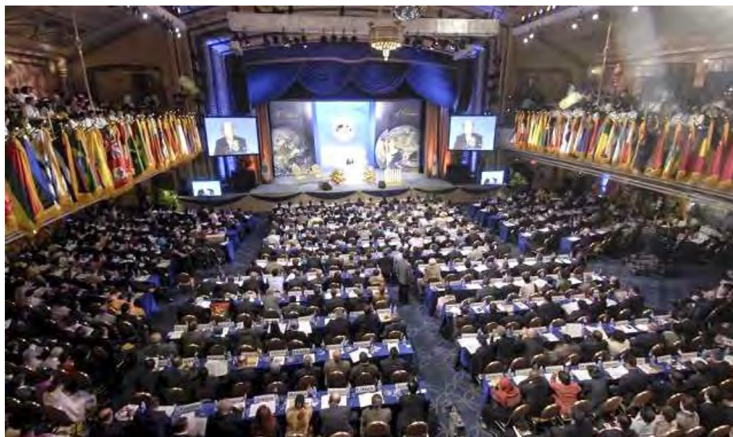
True Father launched the "Substantial" Abel UN at the Manhattan Center