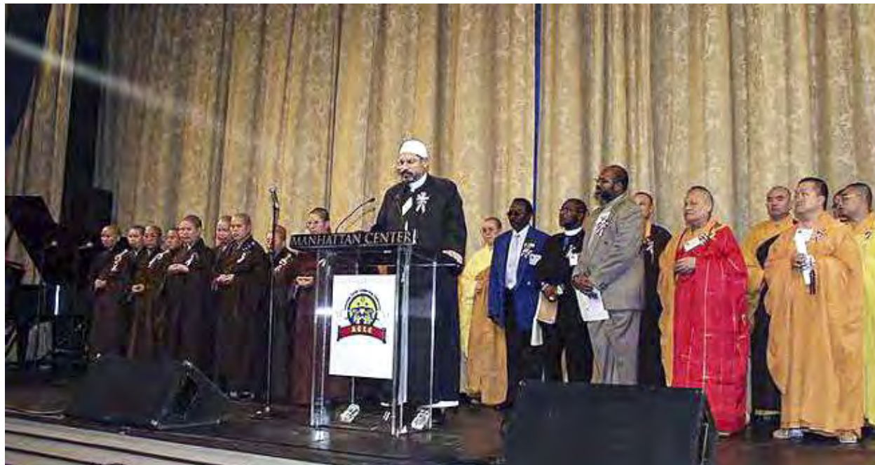
More than 1,000 clergy from all faiths attended the Interfaith Prayer Breakfast and Day of Prayer and Healing to offer prayers for the victims of the 9/11 tragedy in New York and Washington, D.C.