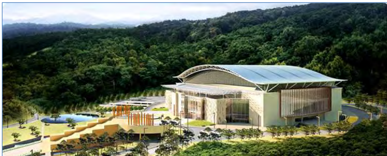
Design plans for the Cheongshim Peace World Center.

Three thousand people attended the groundbreaking ceremonies for the Cheongshim Peace World Center on October 28, 2008. Designed to hold 25,000 people, it was created to be the largest and most sophisticated multipurpose cultural center in South Korea, eight times larger than the Sejong Center for the Performing Arts and twice as large as the Olympic Gymnastics Hall, both located in Seoul. With three floors underground and four floors above, it was designed to be the first Korean arena with folding chairs, a state-of-the-art moving stage and an audiovisual system to host an array of events including concerts, business conventions, corporate events, indoor sports competitions, educational events, expositions and television commercials. The arena would take three years to complete and addressed True Father's long-held desire to see an iconic center for global culture near Chung Pyung Lake.