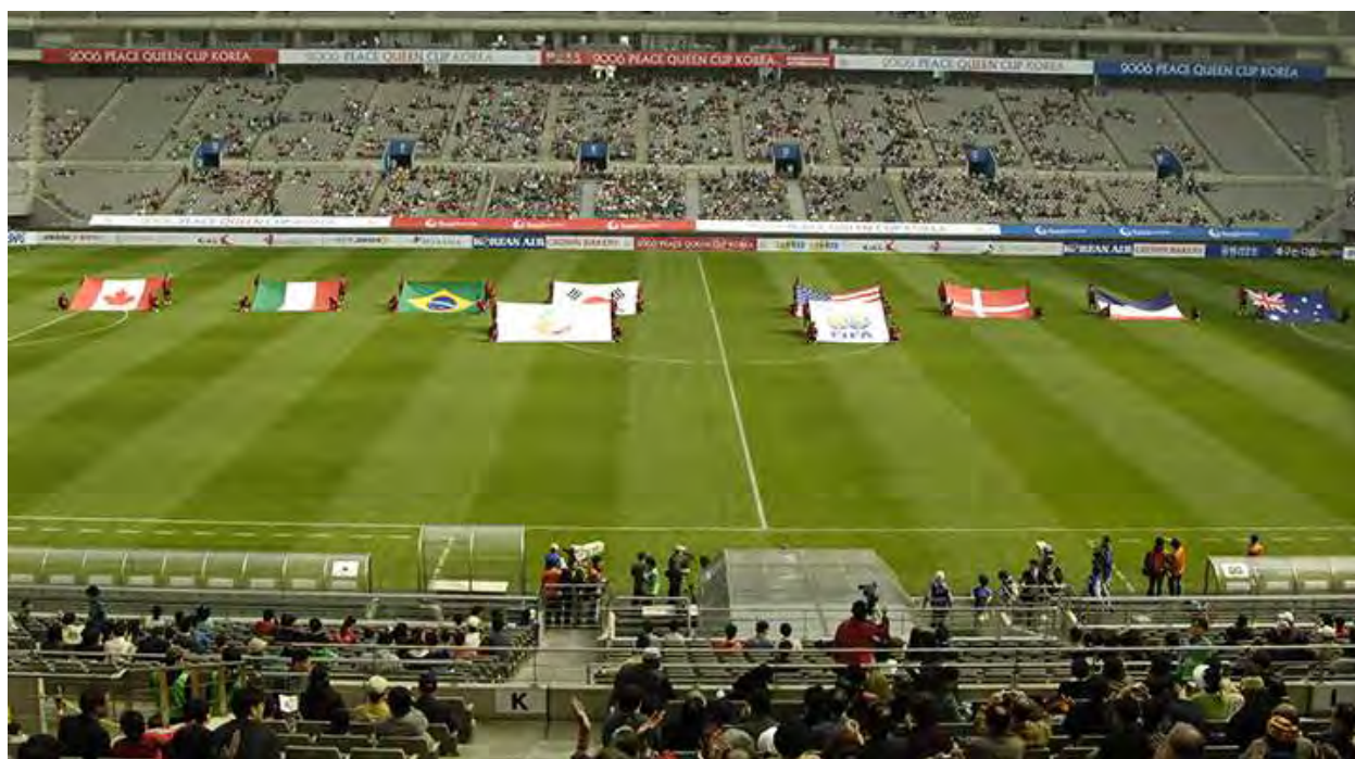
The Inaugural Peace Queen Cup Tournament is held in South Korea.

Following the 2002 World Cup soccer tournament jointly sponsored by Korea and Japan, True Father