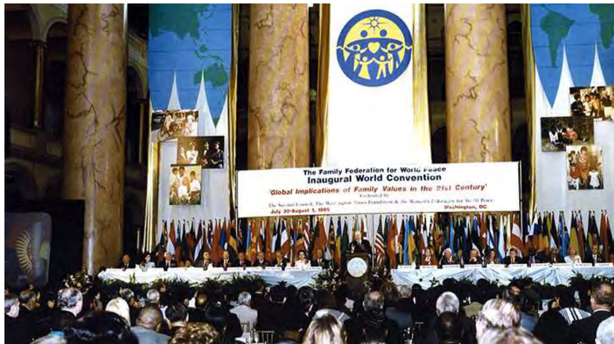
The inauguration of the Family Federation for World Peace and Unification took place in Washington, D.C.

True Parents convened the Inaugural World Convention of the Family Federation for World Peace and Unification (FFWPU) before 400 delegates and over a thousand participants at the National Building Museum in Washington, D.C., from July 30 to August 1, 1996. This was the Unification movement's most spectacular federation launch and included an astounding list of dignitaries: two former U.S. presidents of the United States, Gerald Ford and George Bush; former Costa Rican President and Nobel Peace Prize winner Oscar Arias; former Prime Ministers Edward Heath of Great Britain and Brian Mulroney of Canada; thirty-six one-time heads of state or governments; university presidents including Boston University's John Silber; Christian television personality Robert Schuller; Christian Coalition Executive Director Ralph Reed; Coretta Scott King, the widow of Martin Luther King Jr.; Maureen Reagan, the daughter of former U.S. President Ronald Reagan; well-known comedian Bill Cosby; and Christian singer-actor Pat Boone. In addition, the main proceedings were covered live by C-SPAN television network.