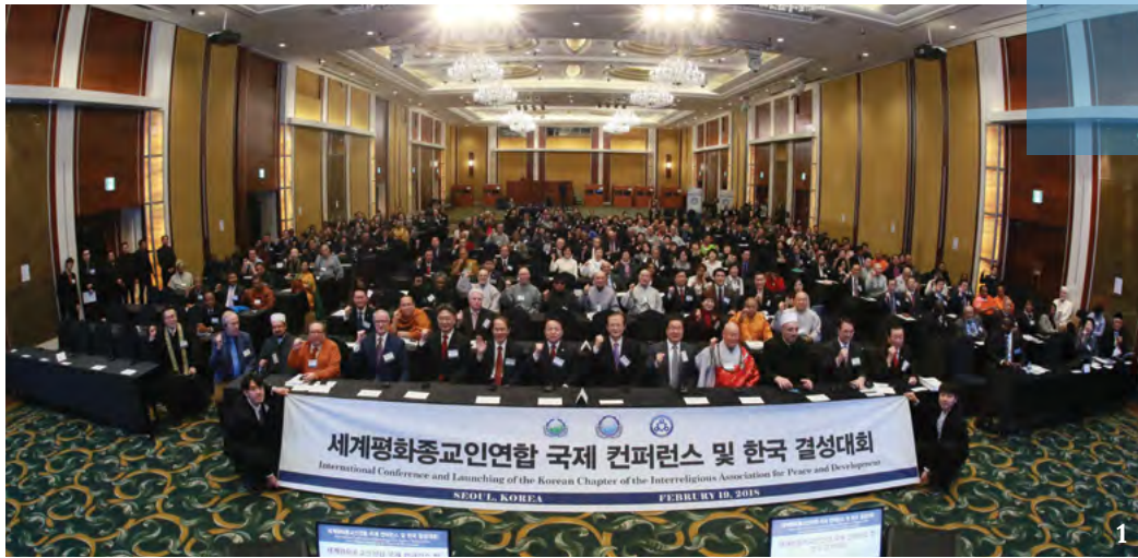
1 Launch of the Korean Chapter of the Interreligious Association for Peace and Development