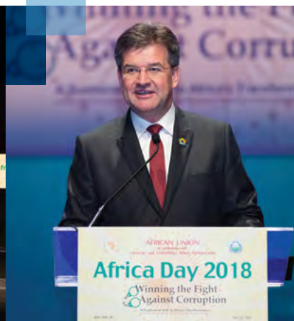
H.E. Mr. Miroslav Lajčák, president of the 72 nd Session of the UN General Assembly