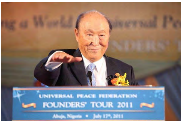
Difficult translation job: Father Moon speaking in Abuja, Nigeria July 17, 2011