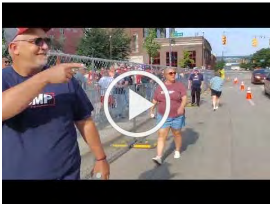
2nd King's Trump Mobile in Michigan!