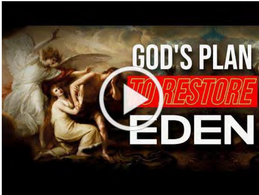
What is the Providence of Restoration?