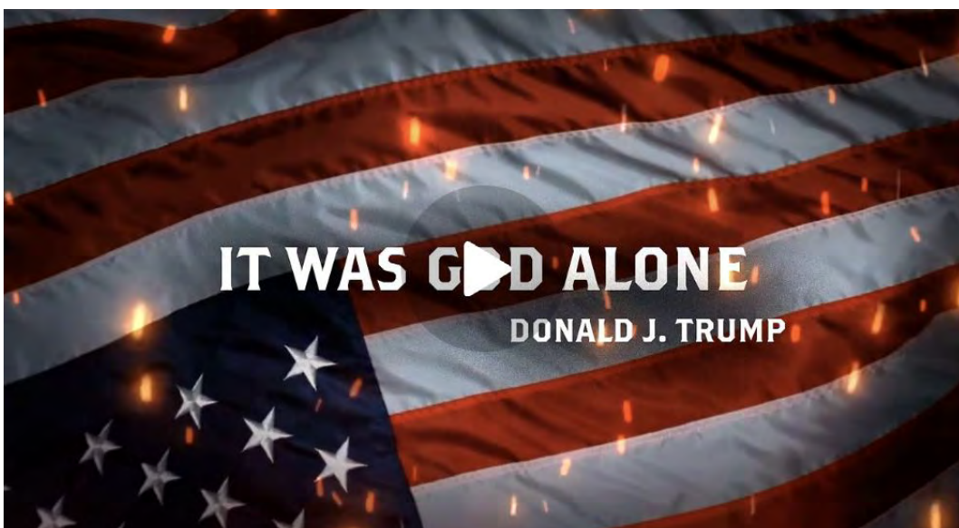
It Was God Alone (Official Lyric Video)

Hak Ja Han said that the age of teaching Divine Principle is over. She doesn't even bother to mention True Father's name.