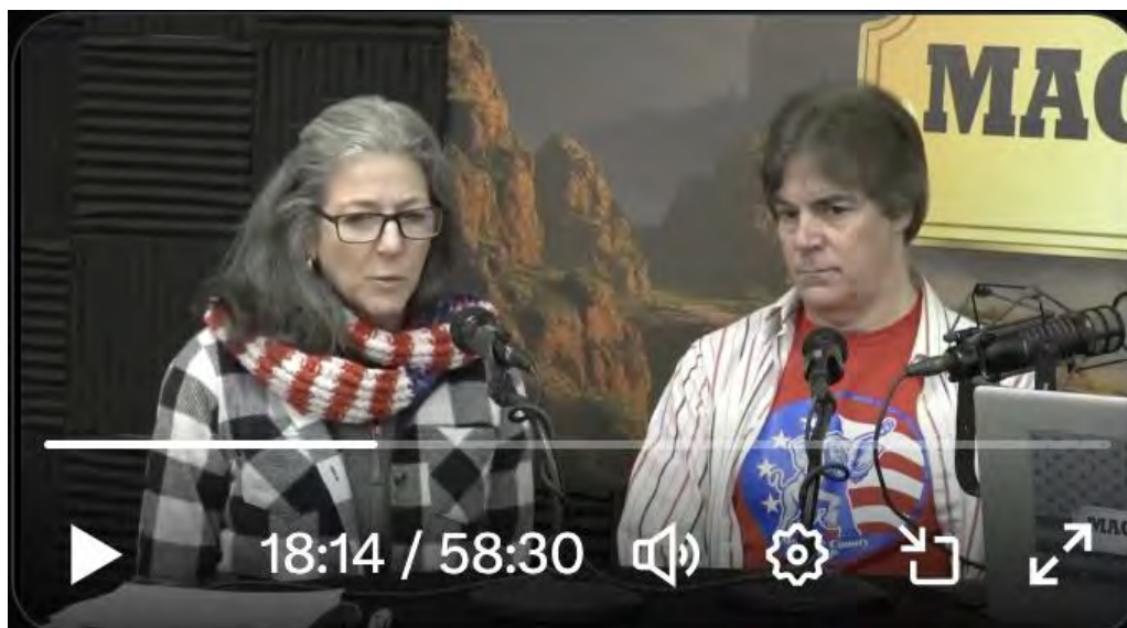
The New Religion of Hak Ja Han