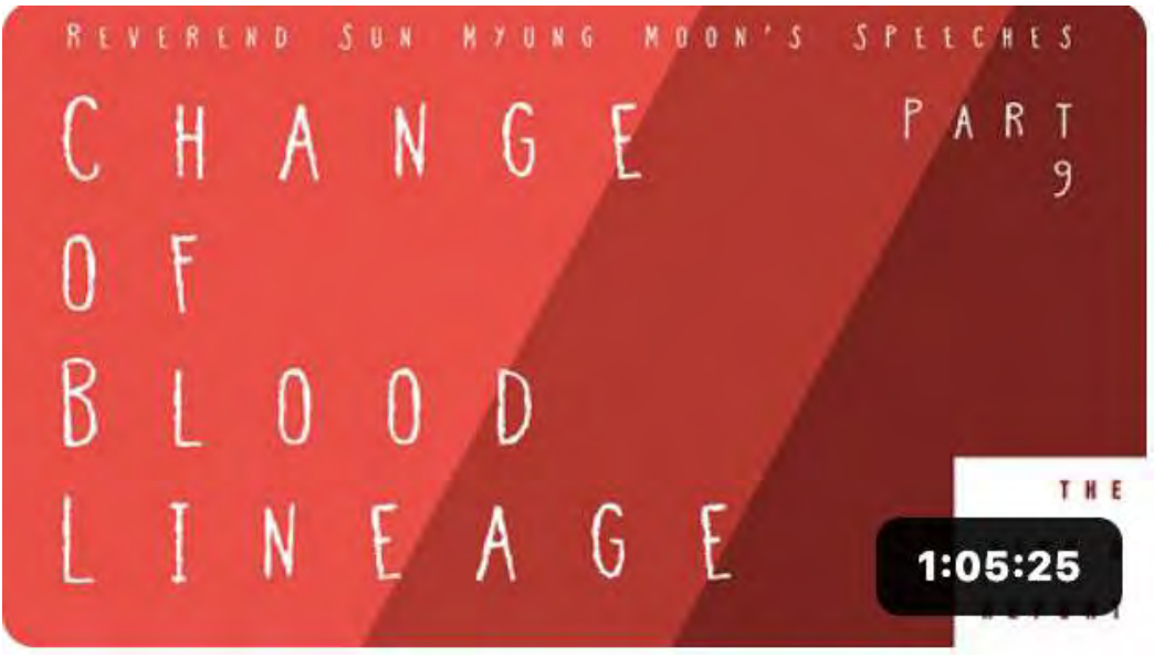
TKR- Change of Blood Lineage Part 9

Father could go through his suffering because he could feel God's heart. We need the Messiah so that our hearts can change.