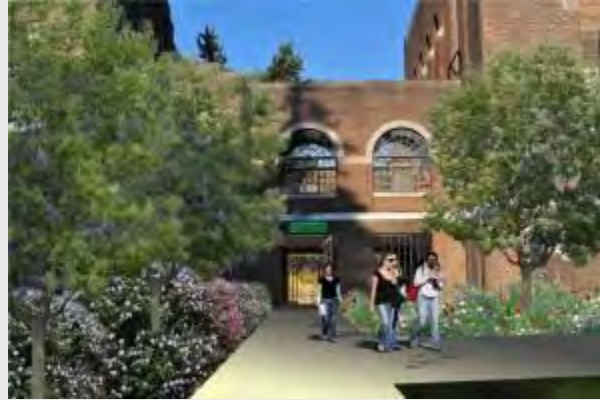
New NW Entrance (photo)

Funding for the college startup is being sought from bond financing to raise $7 million dollars for the first 5 years of construction and operation.