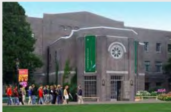
New UTS East Entrance (photo)