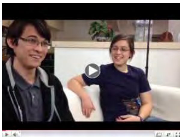
What Would You Give?

that his motivation for making " What Would You Give? " in order to delve deeper into the concept of giving to better understand what it is."